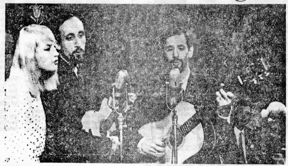
Cafe" to be the perfect showcase for their folk art '50s and '60s.

"I had to bring it back again, and this just seemed like a good time. There is a renewed interest people have in their roots these days. People have broadened their horizons and have become familiar with and fond of music and culture from other lands," Stein said.