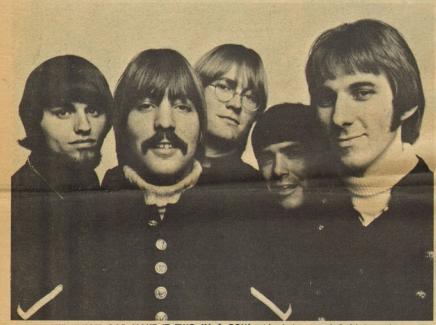
THE UNION GAP MAKE IT TWO IN A ROW with their second Gold Record.