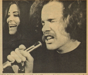
THE FUGS sing in Conrad Rooks' "Chappaqua" with a score written by Ravi Shankar. The music combined the styles of rock, Indian and classical influences.