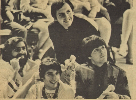
RASCALS REGARD promptness as a vice rather than a virtue.

The Rascals have never been If their first musical out-"had." ings were not brilliant, neither