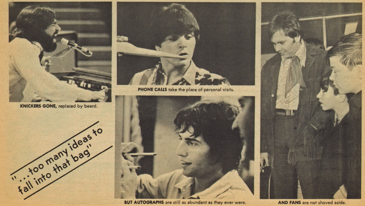
BUT AUTOGRAPHS are still as abundant as they ever were.

This, then, is what the Rascals are all about in 1968 . . , musically and professionally more mature, but in total concept - exactly the