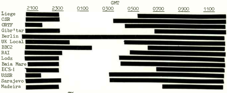
fig.2 1484 k妈3 🖒

Level Six: In certain specialised instances, it has been found that the easiest and most comprehensible method to employ in searching out elusive DX targets is that of constructing a graph. A simple bar graph can show at a glance the stations operative on a chosen frequency during any of the darkness hours at the listener's location most likely to produce such receptions. Thus, a study of the example to follow will immediately show that Berlin is a perfectly conceivable target from North America on 1484 kHz., the International Common Frequency. It will also be noted that during certain months of the year, Gibraltar and Senegal are also within the bounds of possible reception. It becomes advisable once again to use these personally-tailored graphic presentations in concurrence with a set of worldwide sunrise/sunset maps, to determine those receptions most viable from the listener's own location. Although it is realised that such persevering work may become time-consuming and tedious, the dividends of unusual and rarely-reported stations will shortly become obvious.