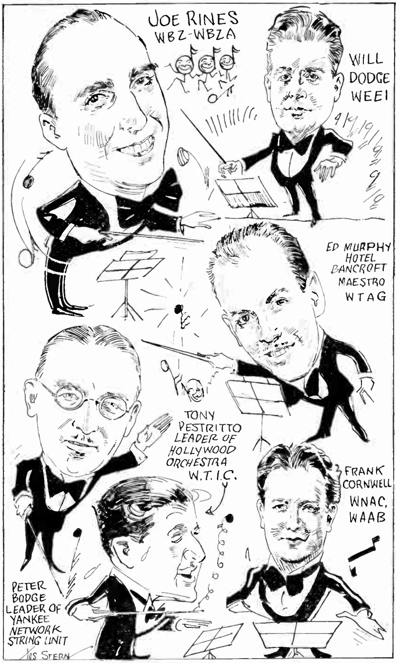
Second in a series of sketches of New England's orchestra leaders