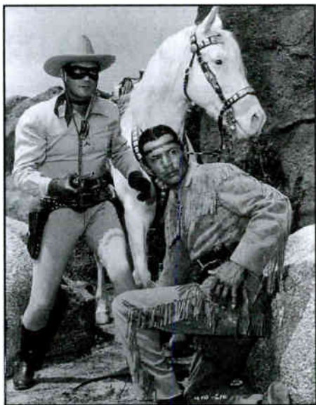
THE LONE RANGER and TONTO Clayton Moore and Jay Silverheels