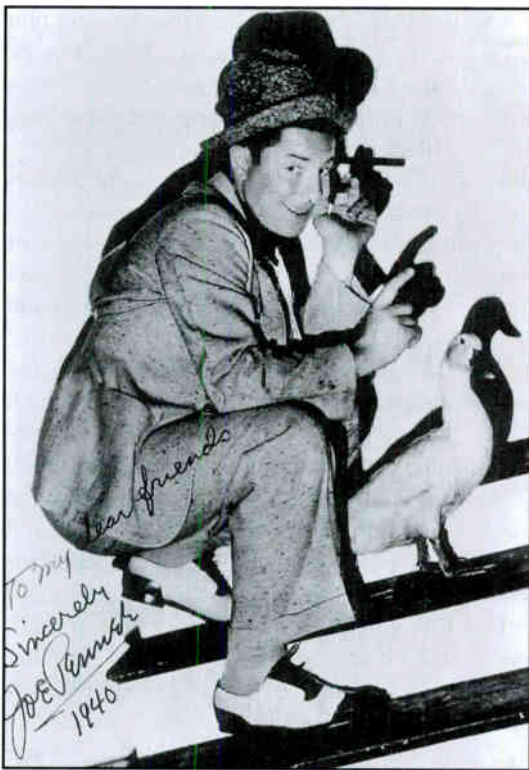
JOE PENNER: "Wanna buy a duck?"