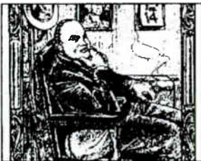
Al Capone idolized George Washington and will always be remembered for the St. Valentine's Day Massacre.