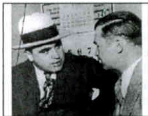
Al Capone, sensitive about the 2 deep knife-slash scars on his left cheek, wanted all photographs taken from the right.