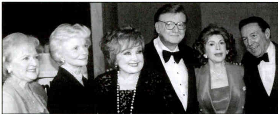
Betty White, Barbara Billingsley, Edie Adams, Steve Allen, Jayne Meadows and Mike Wallace at the Museum's 10th Anniversary Party June 13.

A remarkable group with great accomplishment and, for us, hours of wonderful viewing. Stop in and enjoy.