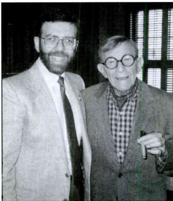
LEONARD MALTIN and GEORGE BURNS

Talking to Lewis only whet my appetite for more. But I blew my biggest opportunity. Entertainment Tonight had scheduled an interview with Orson Welles, to promote a syndicated TV program he was hosting, and assigned one of my fellow reporters to the task. I could have tagged along, but I felt silly doing so, and asked my colleague instead if he would ask Mr. Welles some