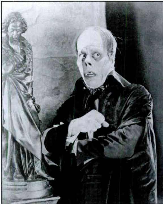
LON CHANEY as THE PHANTOM OF THE OPERA

had brought a little kindness into his life of scorn and shame. Perhaps Chaney projected the hunchback's passion so eloquently because he himself was suffering the self-inflicted burden of a heavy hump strapped to his body which made it impossible for him to stand up straight. He reached deep into his make-