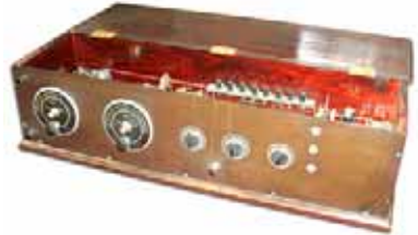
Big 2-dialer - George Kirkwood