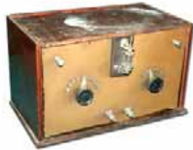
XO Crystal Set - Rudy Zvarich