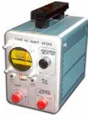
TYPE HC MUSIC SCOPE "Scope" Radio - Jeff LaDoe