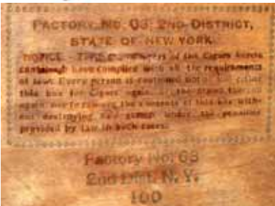
Cigar box crystal set - Art Redman