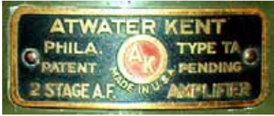
Reconstructed by George Kirkwood