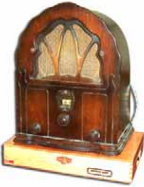
Mini-Cathedral - Dick Bixler