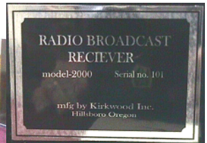
George Kirkwood - Kirkwood Model-2000