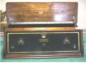
Art Redman - Cockaday LC-27