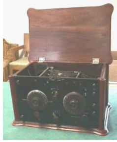
Sonny Clutter - Clapp-eastham Model HRL