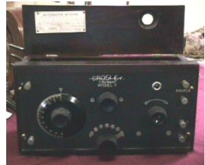
George Kirkwood - Crosley Model V