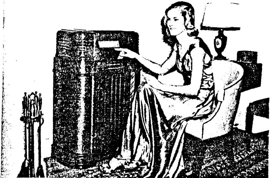
Philco's new model 31-XK features inclined panel, dual-band coverage and push-button tuning for 8 stations.

(Cartoon Clippings will return next month)