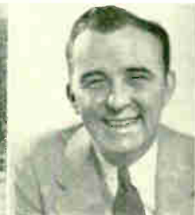
"Uncle Don" Children's Stories