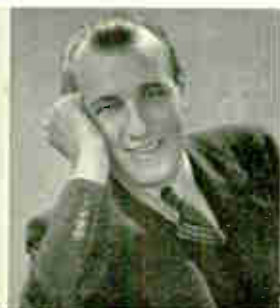
Alfred Wallenstein Musical Conductor