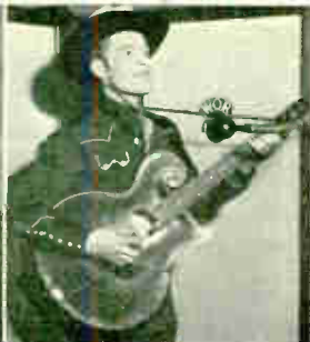
Red River Dave Cowboy Songs