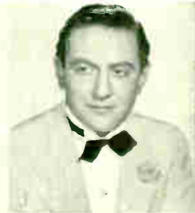
Guy Lombardo For Lady Esther