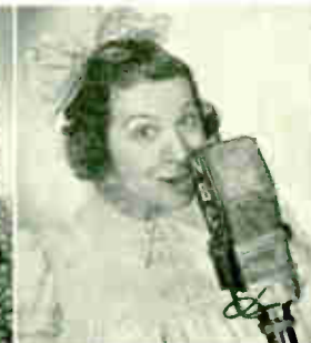
Fanny Brice, 'Snooks'