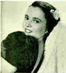
Gale Page Hollywood Playhouse