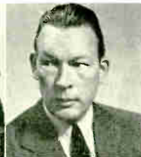
Fred Allen Town Hall Tonight