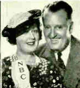
Julia Sanderson—Frank Crumit Battle of Sexes