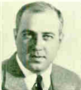
Richard Crooks Voice of Firestone