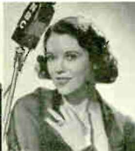
Fran Allison Smile Parade