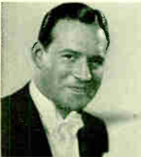
Horace Heidt Horace Heidt and His Musical Knights