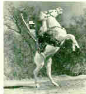
The Lono Ranger Western Dramas