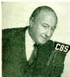
Cecil B. deMille Lux Theatre