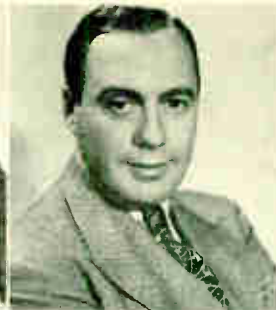
Jack Benny Jello Program