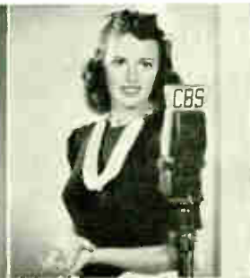
Helen Ward Bob Crosby's Bob Cats