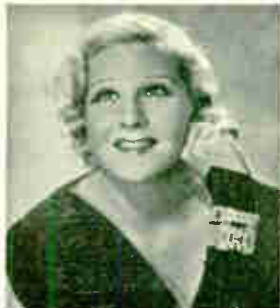
Benay Venuta Vocalist