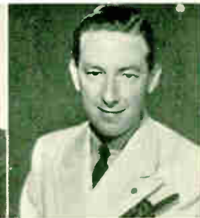
Hal Kemp Time to Shine