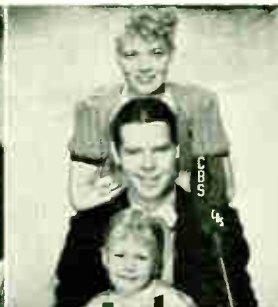
Penny Singleton, Arthur Lake, Larry Sims in Blondie