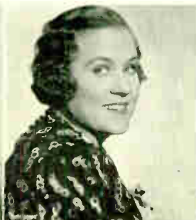
Marion Jordan, 'Molly' Fibber McGee and Molly