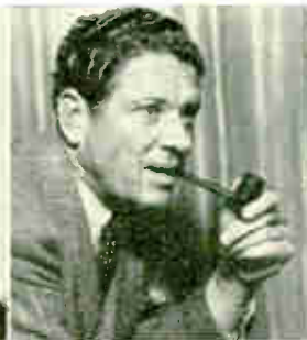
Bob Burns Kraft Music Hall