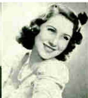
Arlene Francis, 'Betty' Betty & Bob