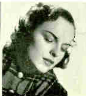
Mercedes McCambridge, 'Midge' Midstream