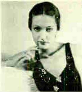
Dorothy Lamour Chase & Sanborn Program