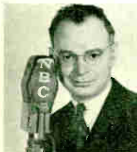
Dave Elman Hobby Lobby