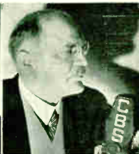
H. V. Kaltenborn Edits the News