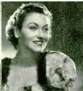
Edythe Wright With Tommy Dorsey