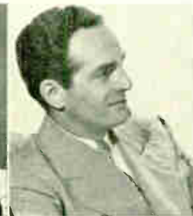
Fred Waring Pleasure Time