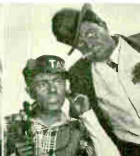
Freeman Gosden—Charles Correll Amos 'n Andy