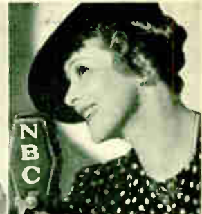
Irene Rich For Welch