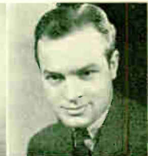
Bob Hope For Pepsodent