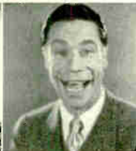
Joe E. Brown Comedian