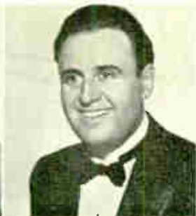
Attilio Baggio Pageant of Melody