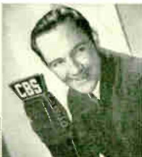
Jimmy Fidler Hollywood Gossip