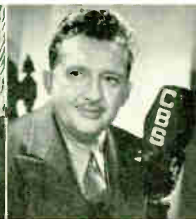
Jean Hersholt Dr. Christian