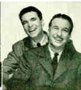
Chester Lauck—Norris Goff