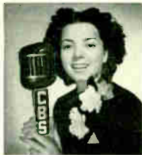
Frances Langford Texaco Star Theatre