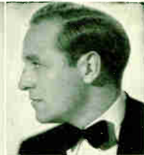
Wayne King The Waltz King