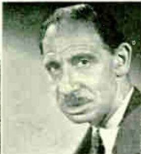
Franklin P. Adams