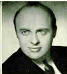
Andre Kostelanetz Tune Up Time