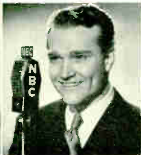
Red Skelton Avalon Time