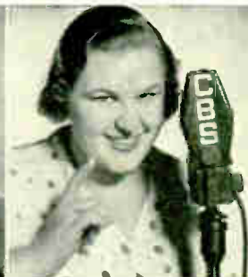
Kate Smith Kate Smith Hour