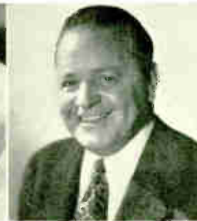
Roy Shield Inside Story