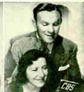
George and Gracie Burns and Allen