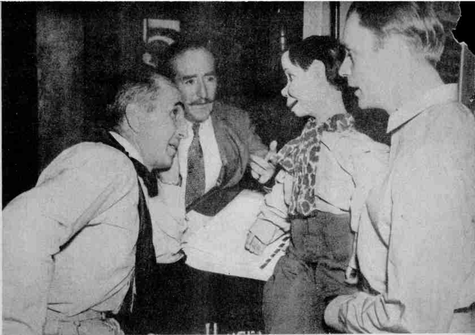
Rehearsing a Scene Before Shooting It