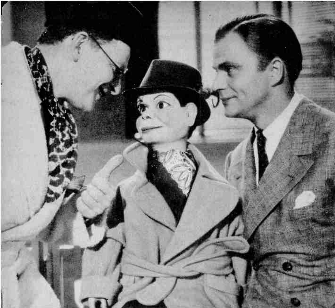
Charlie and Mr. Bergen in a Dialogue Scene With Bobby Clark

the right angle and carefully arranging the monocle in his gleaming eye.