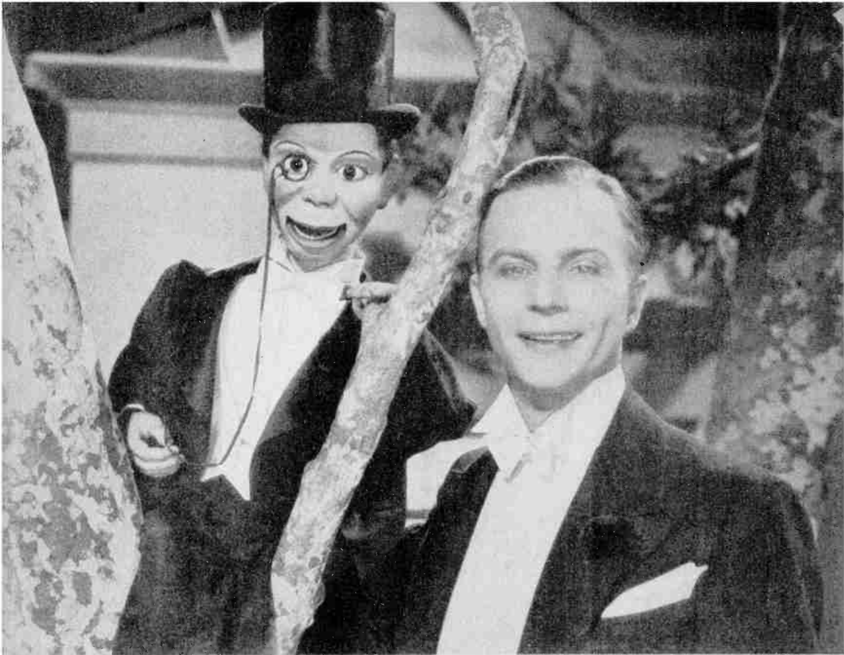
Charlie and His Pal Walking Through the Garden

singers had better watch out when I begin to warble," Charlie chuckled as he finished the song. "I wouldn't be surprised if I landed in grand opera some day, would you, Mr. Bergen?"