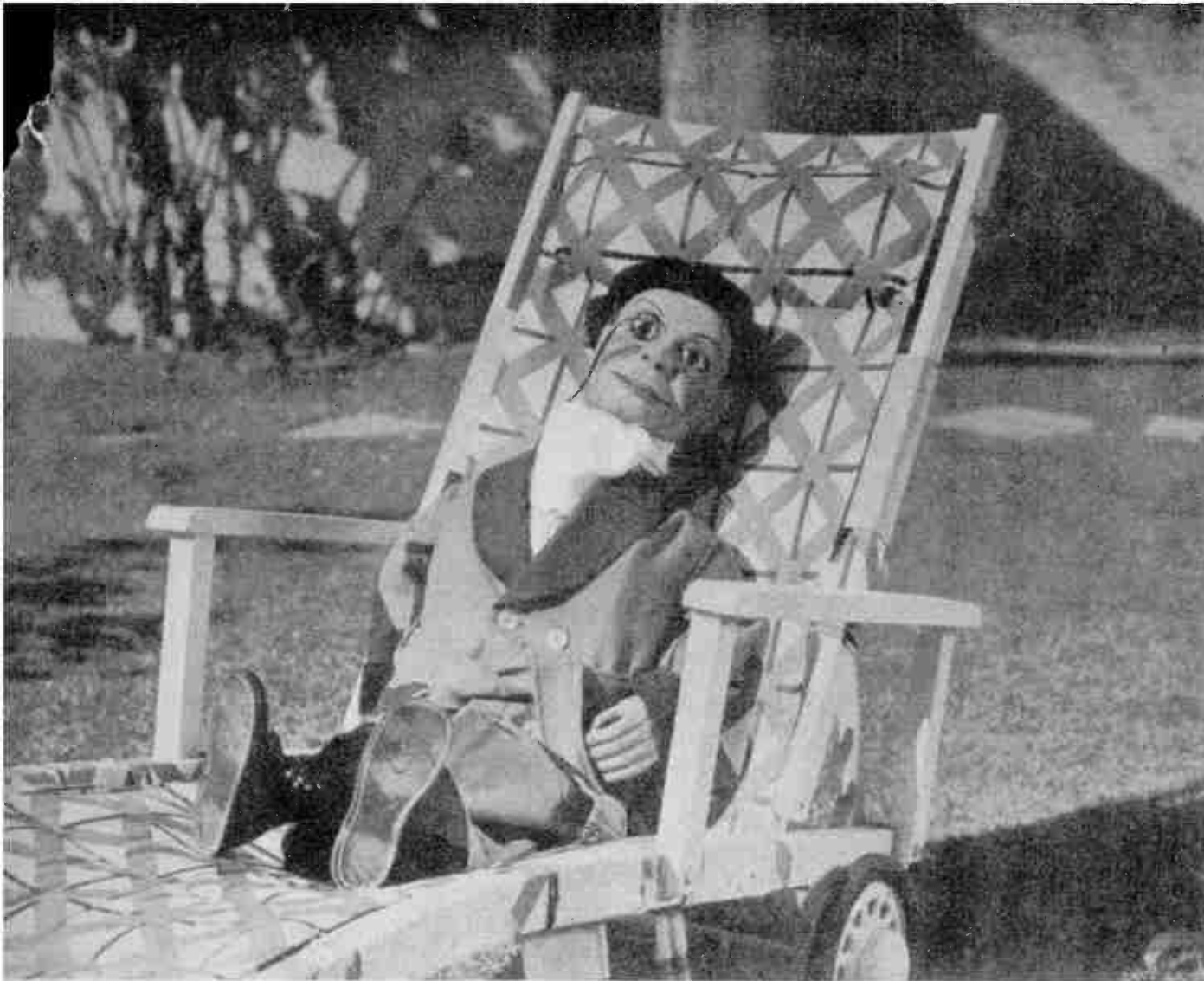
Charlie McCarthy Sunning Himself in a Deck Chair

A FEW MINUTES later they were driving rapidly through the tree-lined streets of Hollywood. The car stopped at the wide gates of the Samuel Goldwyn Studio and Charlie waved merrily to the gateman.