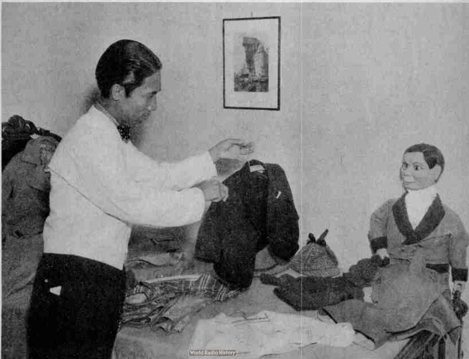
Charlie McCarthy Looking Over His Elaborate Wardrobe

"You haven't time to admire yourself now, Charlie," Mr. Bergen reminded him. "You must hurry and dress."