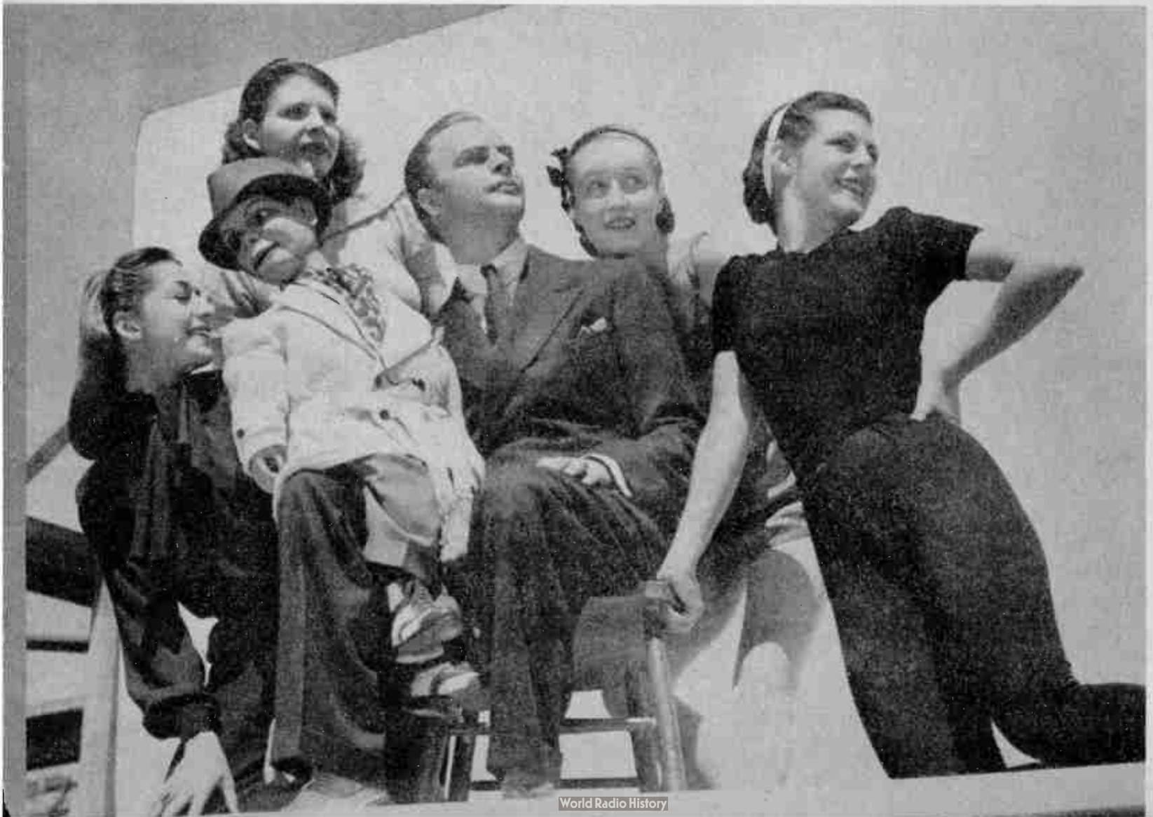
Charlie McCarthy in Glorious Surroundings—Among the Ballet Dancers

"Because she isn't here," Charlie answered, his eyes