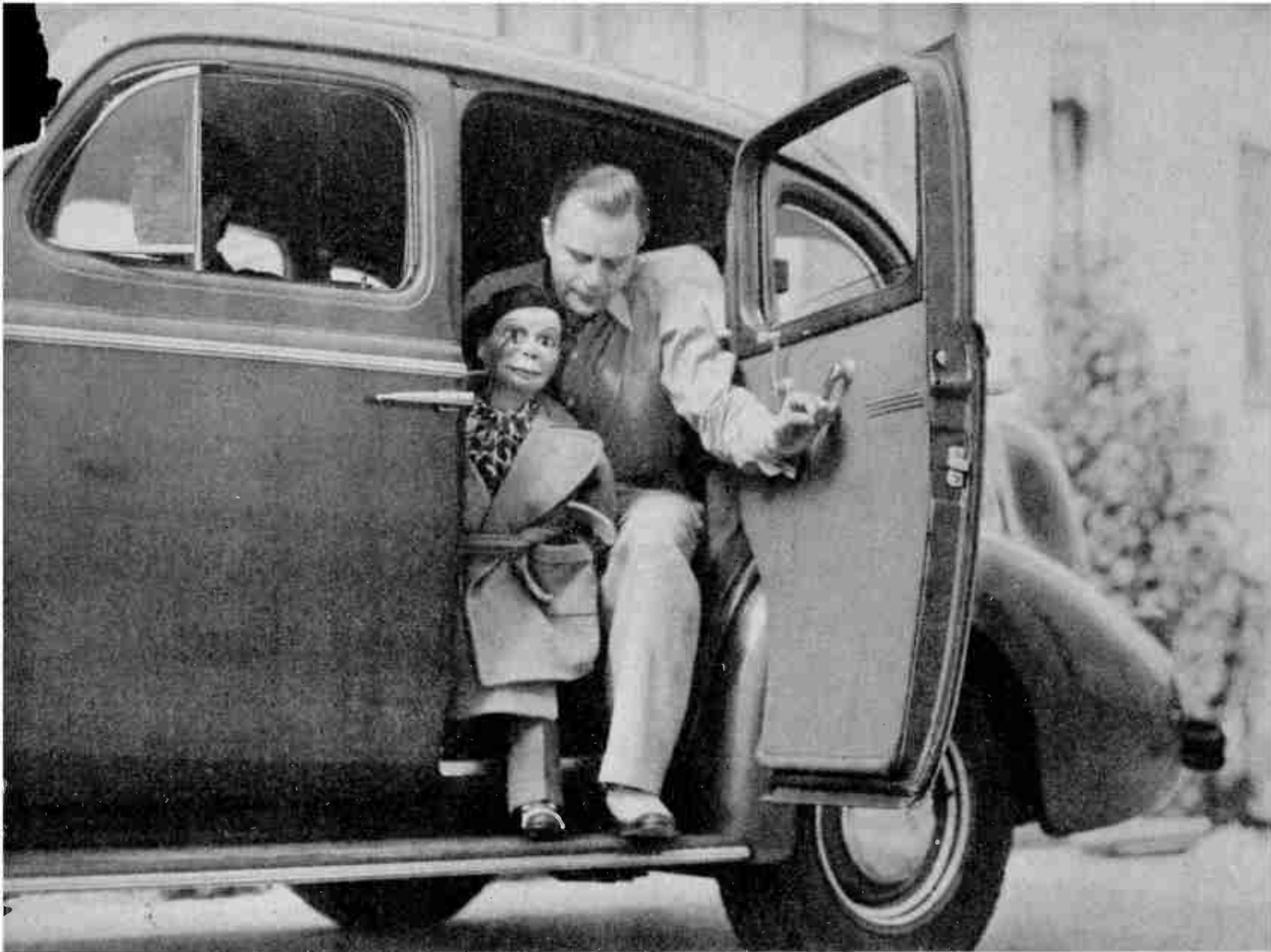
Charlie McCarthy and Edgar Bergen Arriving at the Studio