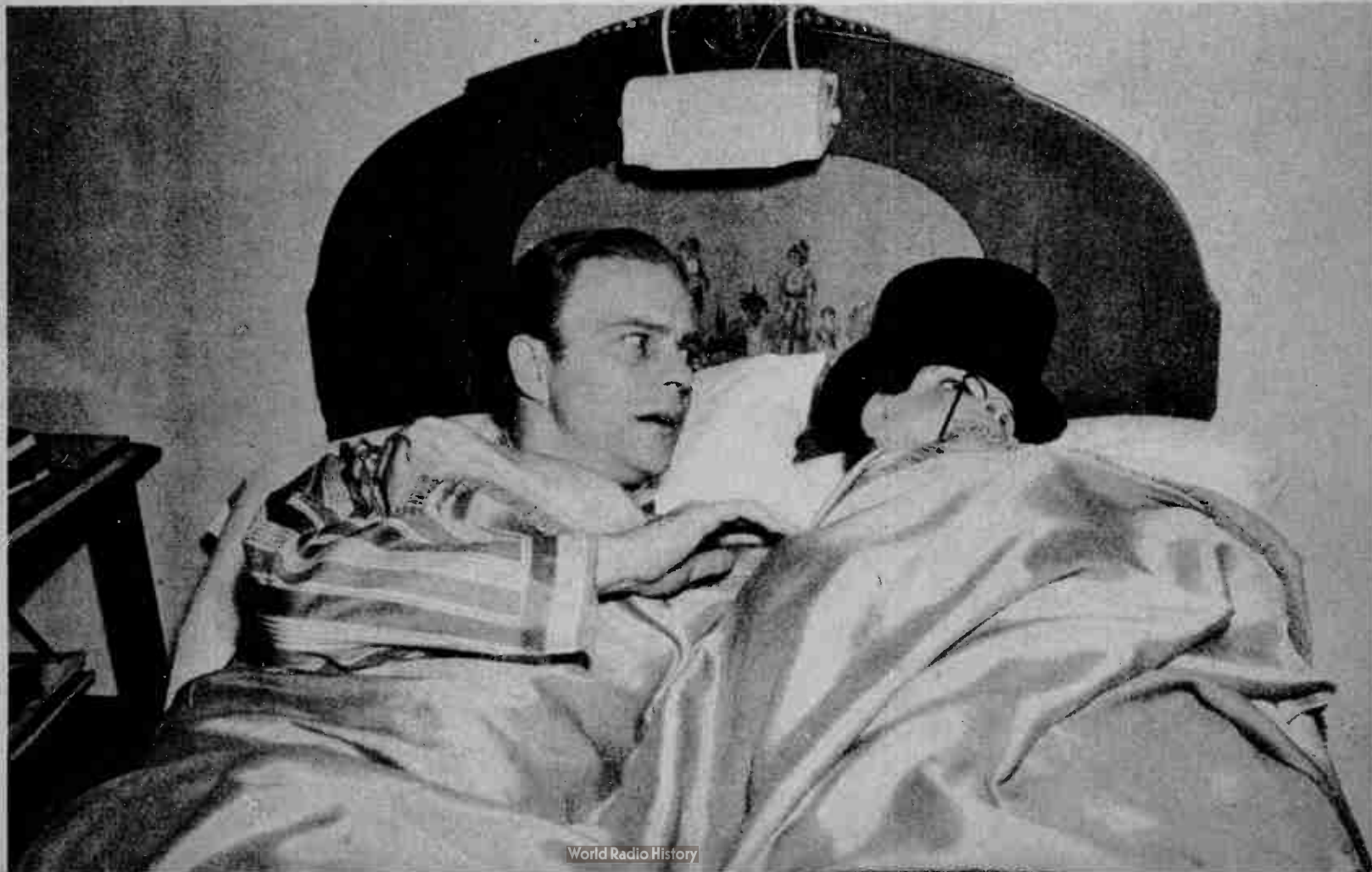
Edgar Bergen Shook Charlie to Awaken Him

"Where was I?" Charlie asked quickly, forcing a bright smile. "Oh, yes. I was creeping into the house, wasn't I? Well, when I tiptoed into this room, it was dark and you were sleeping as peacefully as a baby. So I decided not to run the risk of disturbing you by turning on the lights and undressing. I was thinking