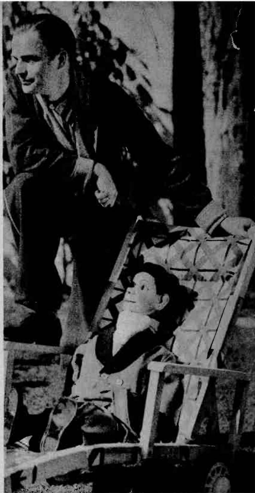
Mr. Bergen Stood Beside Charlie as the Little Fellow Reclined Very Much at His Ease and Thought up New Wisecracks

"When did you study your dialogue, Charlie?" Mr. Bergen asked in surprise, when the rehearsal of the scene was finished.