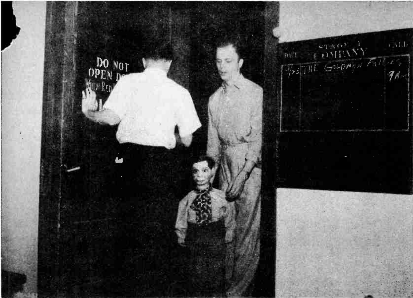
Charlie and Mr. Bergen Entering the Sound Stage at the Studio