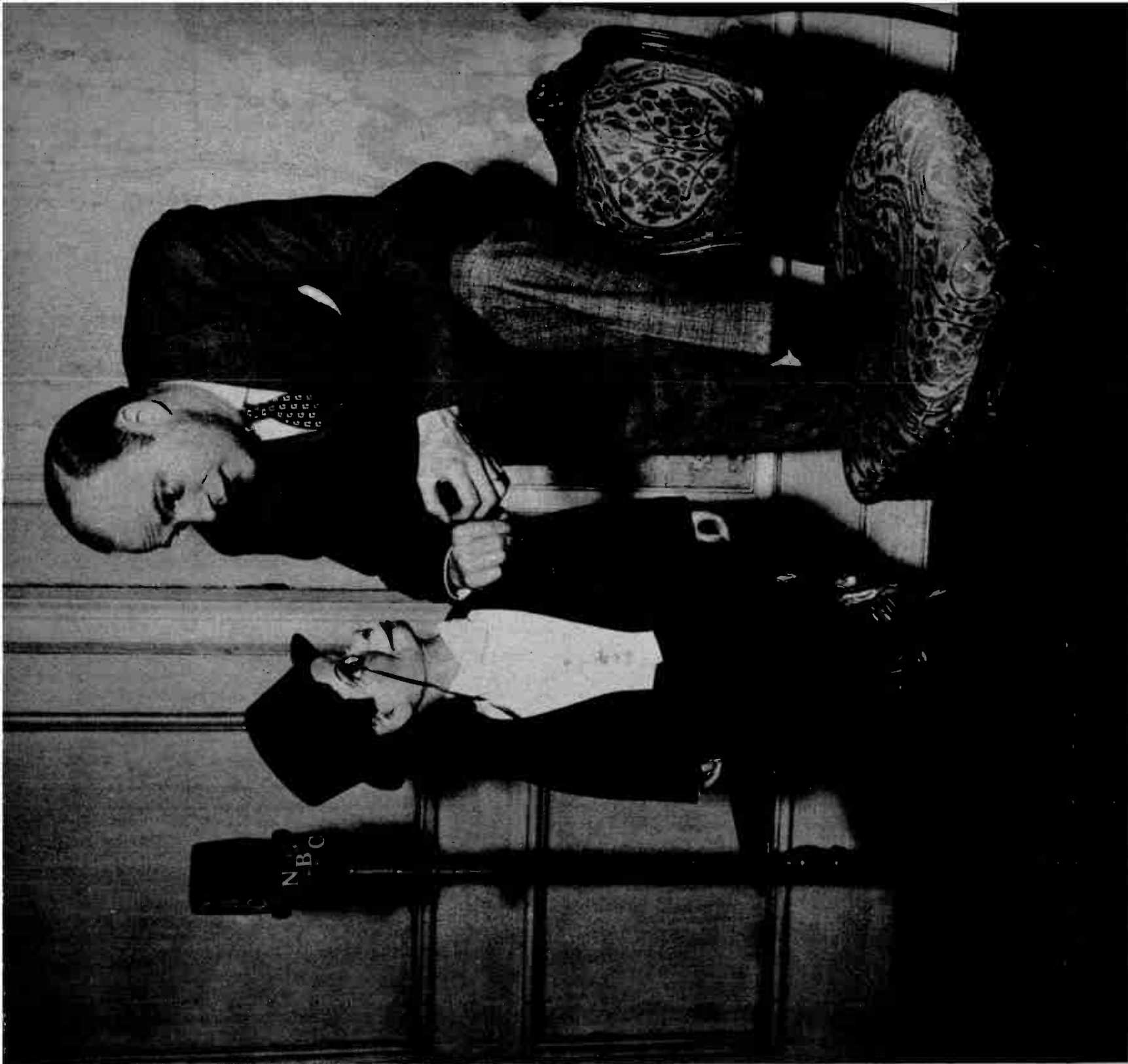
Charlie McCarthy and Edgar Bergen Rehearsing Their Radio Show