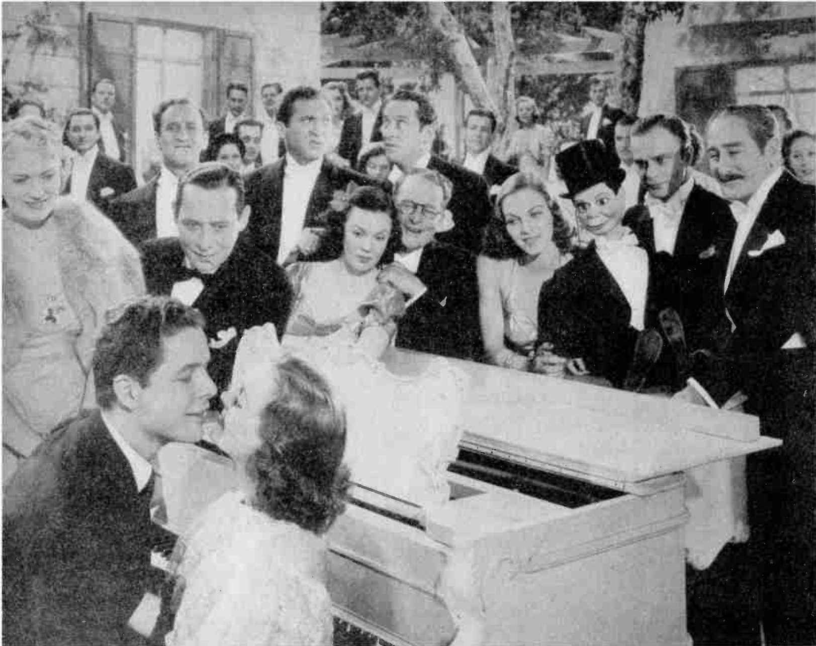
The Garden Party Scene From "The Goldwyn Follies"

WHEN THEY arrived at the house Charlie took a long, leisurely bath. Then he dressed in freshly pressed evening clothes and read the funny pages in the newspaper until the cook called him to say that dinner was served.