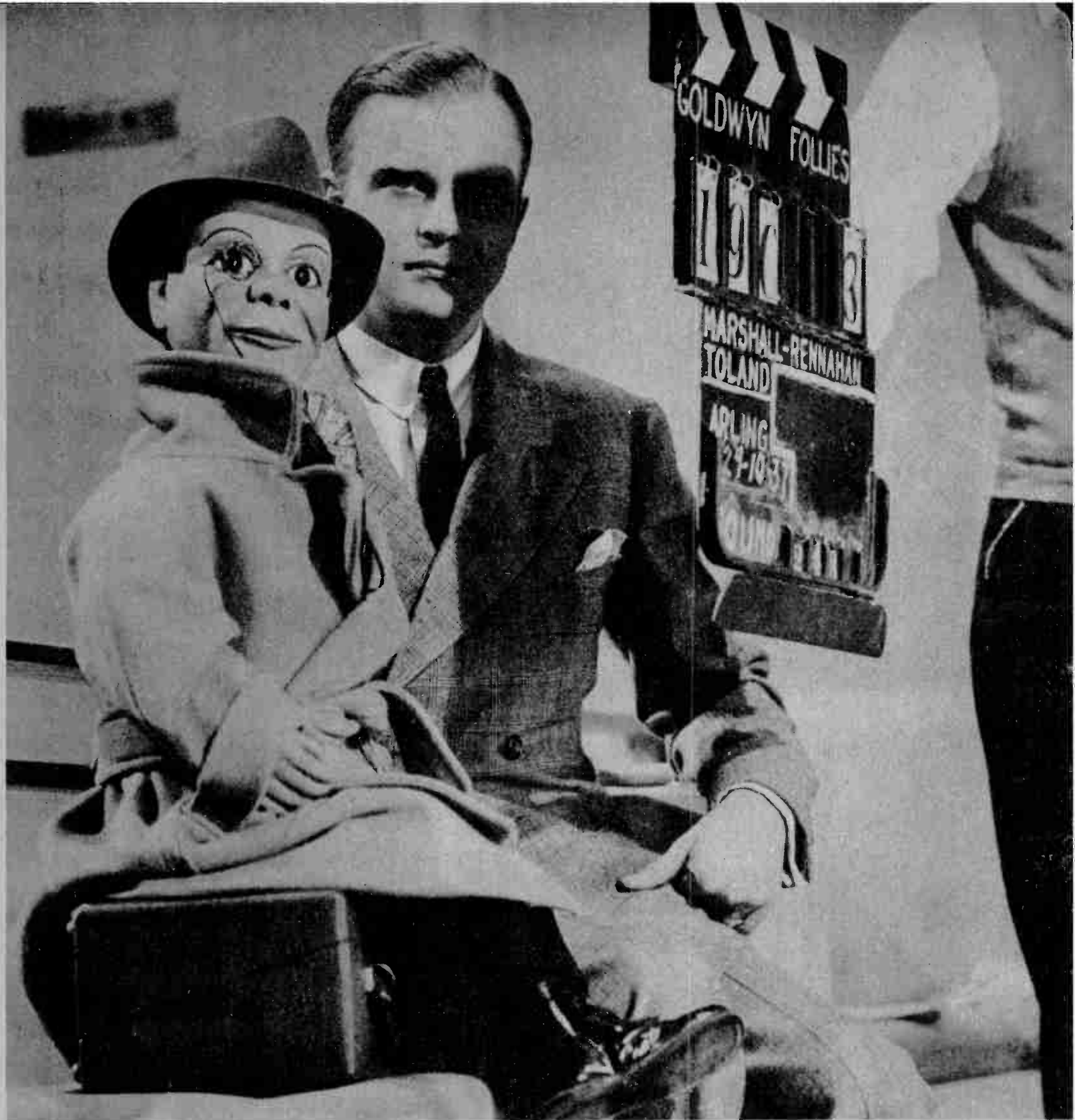
Just Before the Scene Is Shot a Series of Numbers and Names Are Held up to Be Photographed — to Identify the Scene on the Completed Film