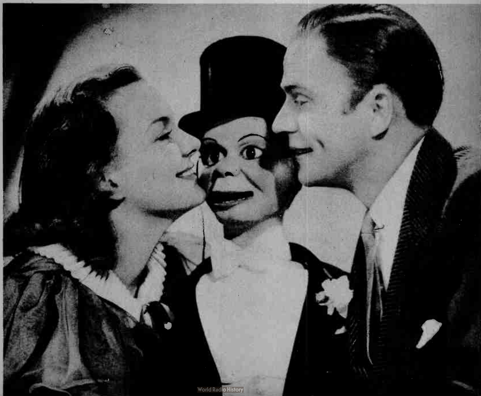
Andrea Leeds—Edgar Bergen—and Charlie McCarthy!

So they stopped at a drug store and Charlie munched his double-decker cone all the way home, occasionally saying "Mmmmmm" to show his pleasure.