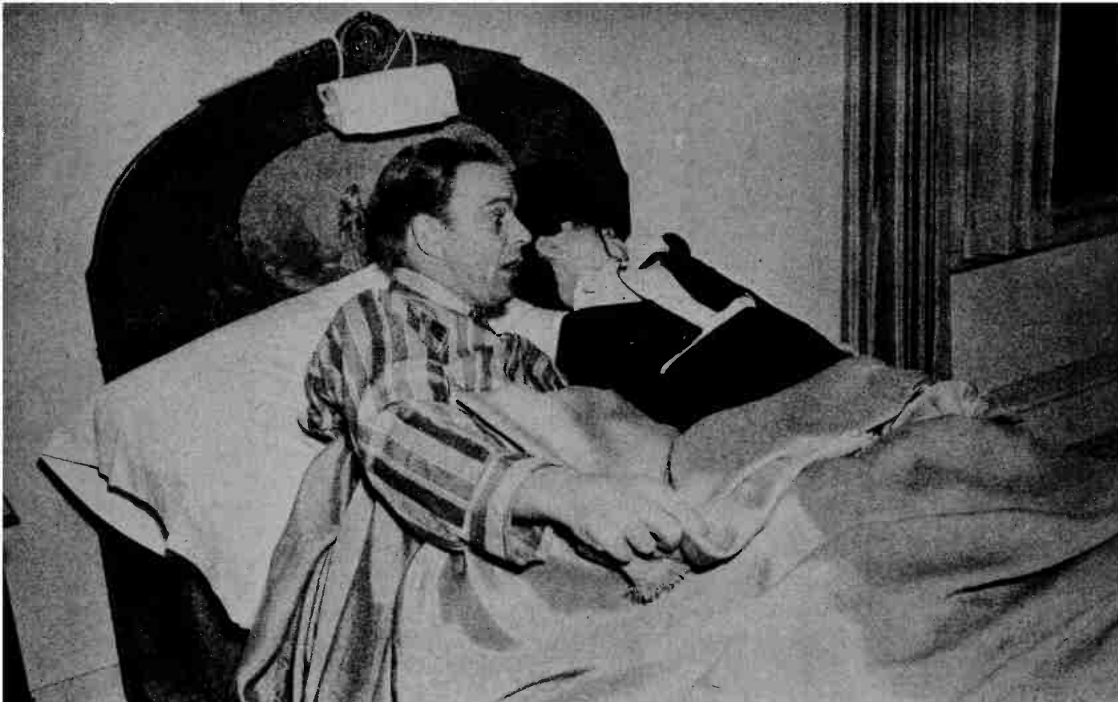
Charlie McCarthy Was Soundly Sleeping in Mr. Bergen's Bed!

T HE GRANDFATHER'S CLOCK in the hall chimed seven deep, rolling notes. Then, as the echoes died in the morning silence of the house, the alarm clock in the bedroom rang with a clanging whir.