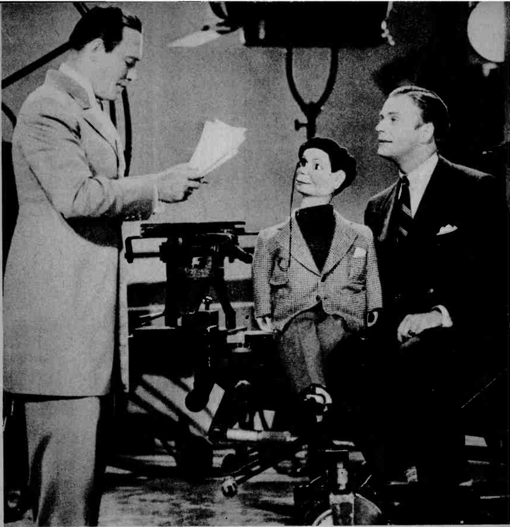
Mr. Bergen and Charlie McCarthy Listening to Phil Baker