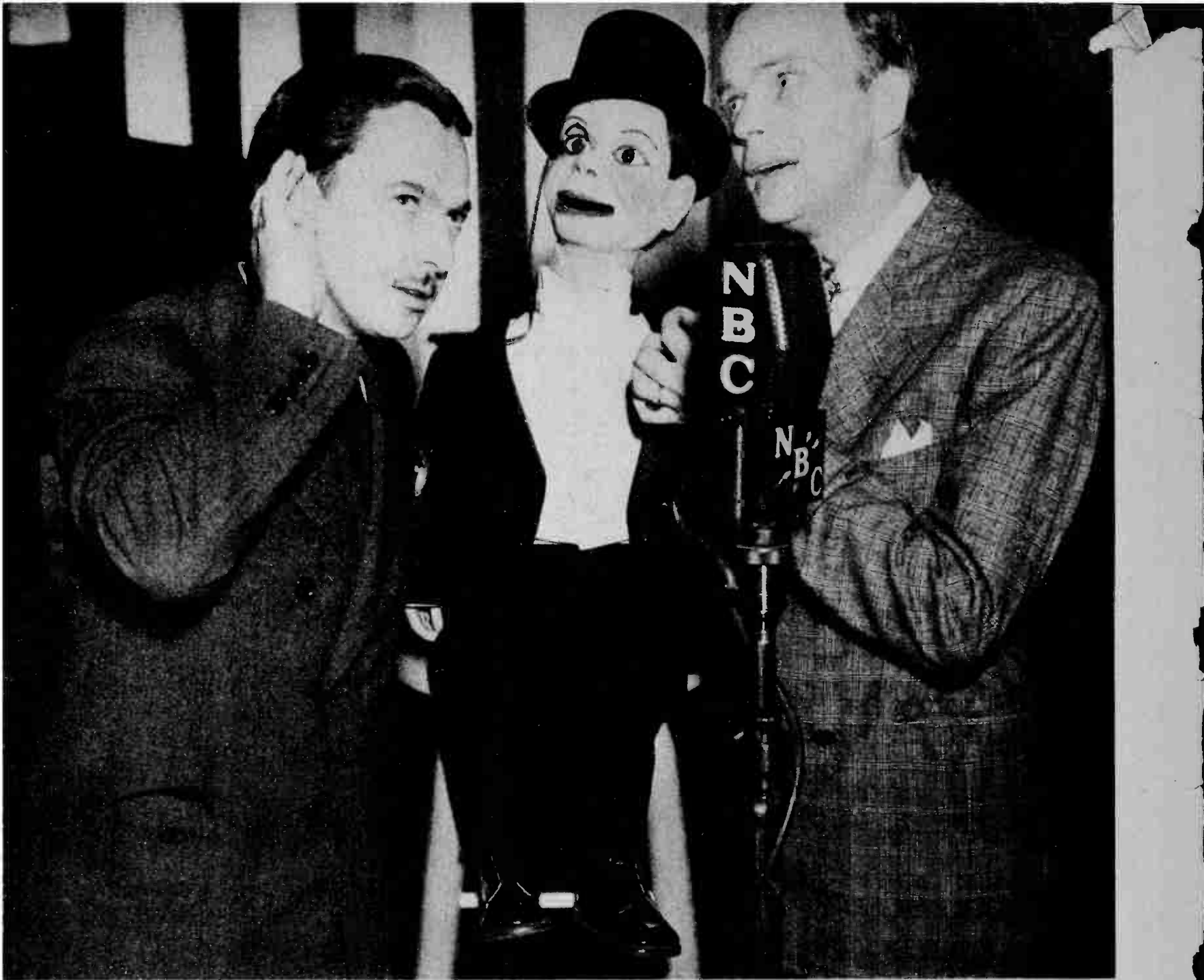
Charlie McCarthy Launching Forth into Song

B UT Charlie McCarthy had one of his favorite dreams—he dreamed that he was speaking into a radio microphone, to millions and millions of listeners, and making them roar with laughter from coast