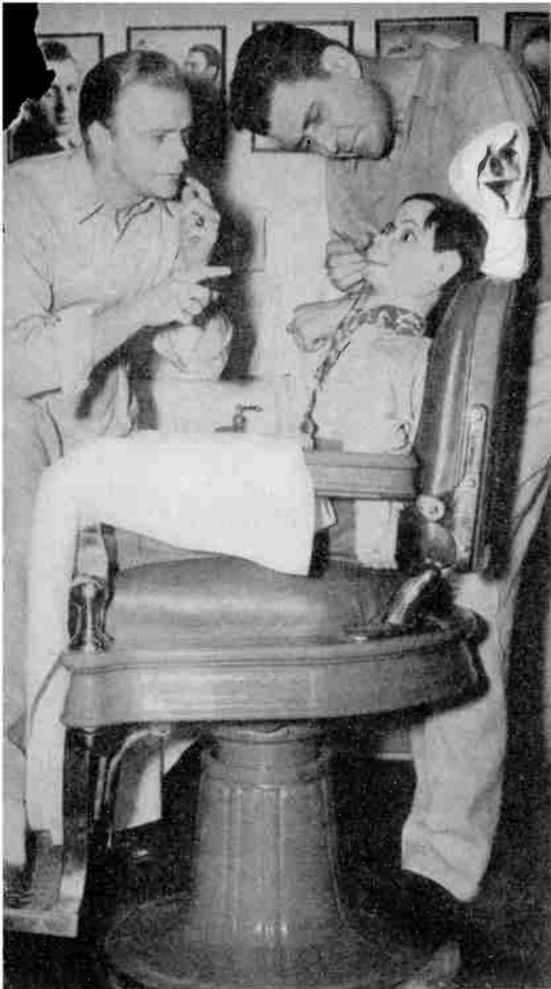
Charlie McCarthy Patiently Undergoes the Ordeal of Being Made up by an Expert Before Going in Front of the Camera — While Mr. Bergen Supervises the Job

"Then I'll be sure that you'll meet me for lunch."