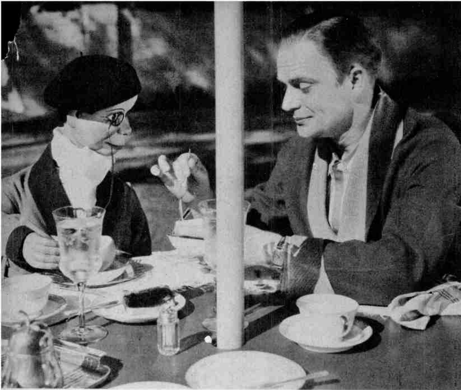
Breakfasting in the Garden—With Grapefruit

N OW THE CLOSET in his bedroom was filled with suits and coats, hats and shoes of all kinds and colors. Full dress clothes. Tuxedos. Sports coats. Slacks. Sweaters. Shirts of all hues. Plainly tailored daytime suits. Silk hats. Soft hats. Berets. Knitted caps. Sports shoes of brown and white leather. Black street shoes. Shiny patent-leather dress shoes.