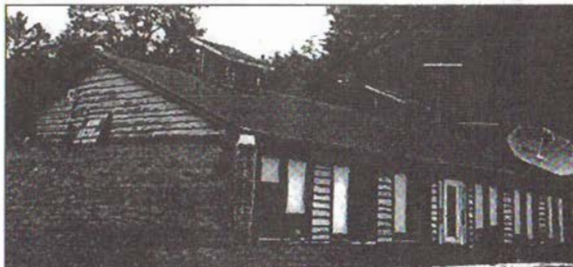
doggy! Why even Bob, our ban- Side trips to locations such as the home of WVMR are always a

come on and, for safety purposes, shutdown of WNRC at midnight. The station returned to the air for a few hours the next morning. Sunday morning and afternoon, September 5, went very well as NRC '99 Bridgeport was winding up. First was the morning breakfast buffet with possum, homefries, bacon, okra, and that delicious blackbird pie made by Granny and Aunt MillieMae, hoo quet and morning host, served us part of any convention.