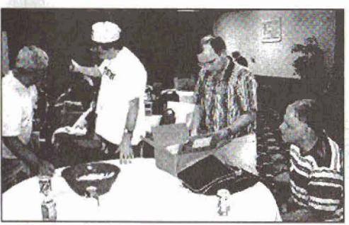
Convention-goers unpack auction items and get ready for the convention banquet.