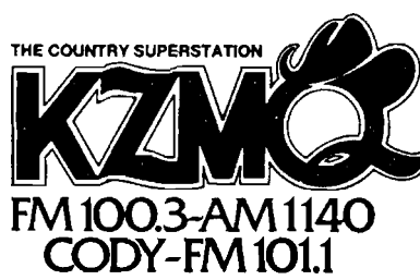
P.O. Box 352, Greybull, WY 82426

*Notes: WNVL-1250 requested WLSG as shown last issue but WLXG-1300 protested that this call was too phoentically similiar to their call, thus the request for WUGR. WEVE-1340 change to KRBT is not a typo; Eveleth is in that part of Minnesota that can have either "W" or "K" calls. KXLQ-1490 change to KBAB was set aside; station remains KXLQ. Although the 1600 facility in Warner Robins was taken off when the 1670 station went on, the fact that they spent the $50 to change calls on this facility suggests plans for it to return.