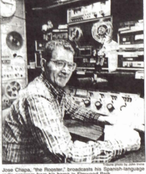
radio program from his home in Elmwood Park.

now has three full-time commercial Spanish stations and two Spanish-language television