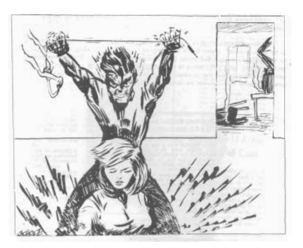
"DOES MY VACUUMING BOTHER YOU, DEAR?"

Ham and/or CB licences--Neither 79%; CB 12%; Ham 7%; Both 2%.