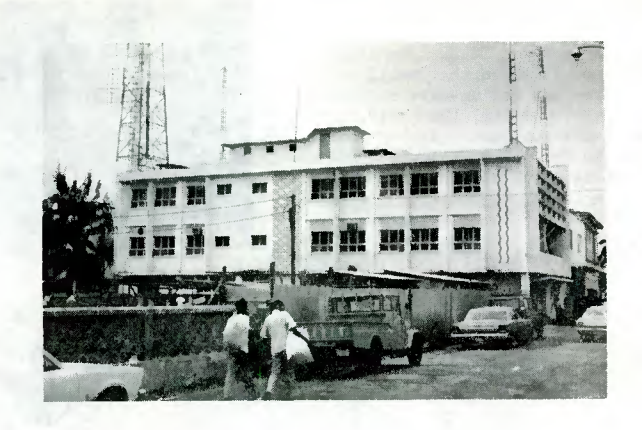
Radio Belize Studios - Albert Catthouse Bldg.

meter band was non the less active, with Zelaya/5950, Casino/5954, TGNA/5955, Occidente/5962, El Salvador/5980, Reloj/6006, Sotavento/6020, TIFC/6037, América/6050, Junco/6077, Hernandez de Cordoba/6100, Mérida/6105, Suyapa/6125 and TGMD/6180 all presenting good accounts of themselves. In addition, the special Radio Canada eclipse test was well-heard on 5970 kHz, the only audible non-Central American at that hour.