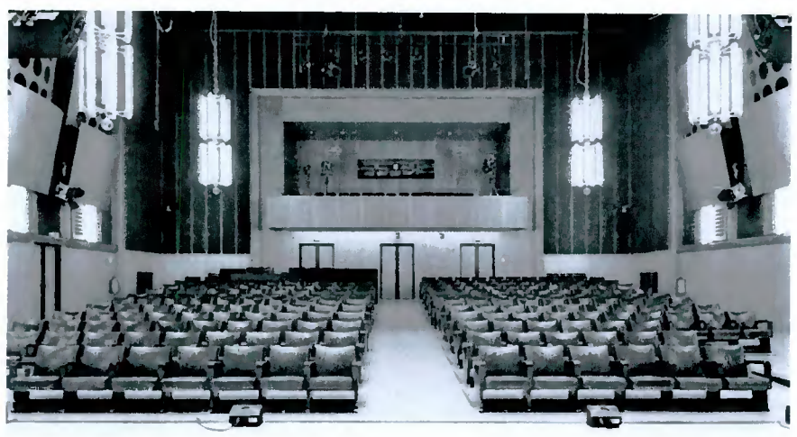
ORF Grosse Sendesaal

In the Funkhaus foyer, he lambasted the decision by ORF in 2016 to sell the historic broadcasting house we were stood in, and we had to agree it seemed strange to have sold such a historic and cultural