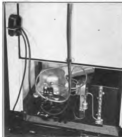
Showing Test Relay Connected

A GREAT time saver on PHILCO Conservador Refrigerator service calls is provided in the test relay illustrated below. The test relay affords one of the best and quickest ways of locating various troubles in the electrical circuit. The use of the relay also eliminates the