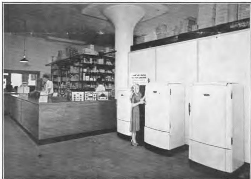
Parts Department, Roskin Distributors, Inc., PHILCO Distributor in Hartford, Conn.

The PHILCO Model 077 Signal Generator and PHILCO'S several type circuit testers, such as the Model 026, are basic in design and are quality-built throughout. They change but little from year to year because radio circuit design is basic. These high-quality test instruments, built under the supervision of PHILCO'S engineers, can be purchased with utmost confidence in their continued usefulness through the years.