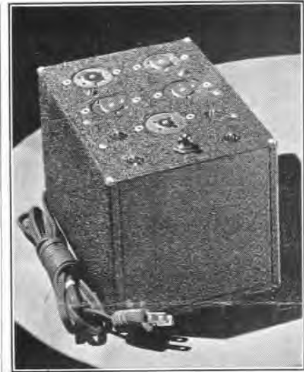
Model 013 Vibrator Tester

The instruction sheet accompanying the tester lists all makes and models of auto radio receivers, indicates the proper test socket in which to check the vibrator and also shows the equivalent