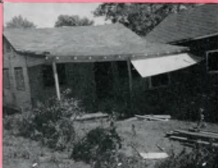
◀ HOUSES ON RIVERSIDE ROAD in the Fergusonville area damaged by the flood.