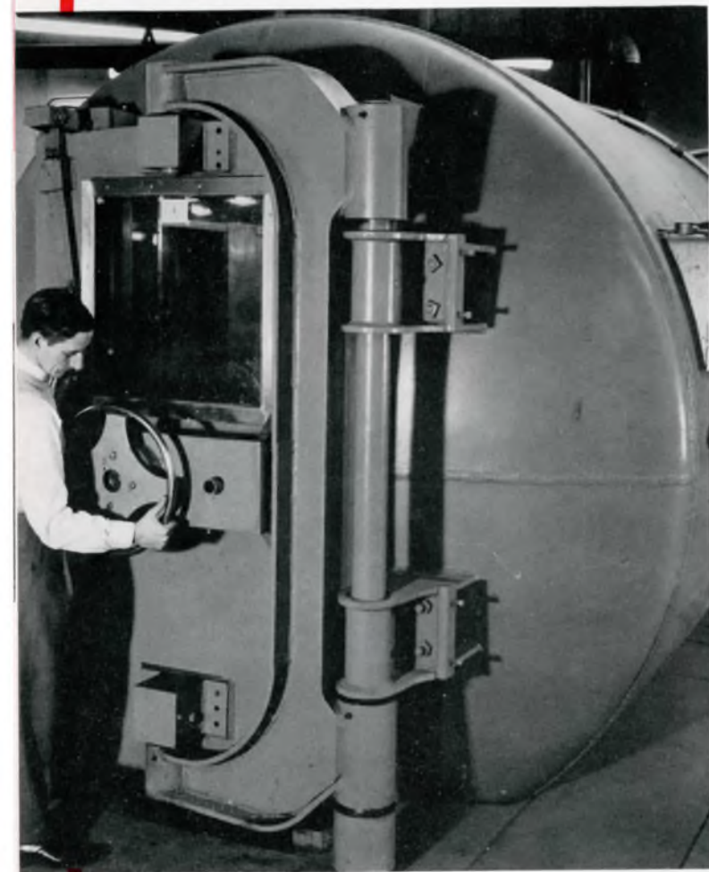
HORIZONTAL stratosphere chamber, 13'8" long, 6' wide and 6'6" high, permits simultaneous testing of complete systems under true stratosphere conditions. It simulates atmospheric conditions encountered at any altitude up to 75,000 ft. (14.3 miles), with temperatures controlled from 200° F. to minus 100° F., and relative humidity from 30 per cent to 95 per cent.

In an early issue of the PHILCO NEWS there will be an article on the production departments of the G&I Division.