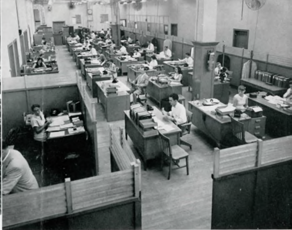
THE GENERAL OFFICE of the G&I Division's Sales Department, where all Government and Industrial contracts are administered.