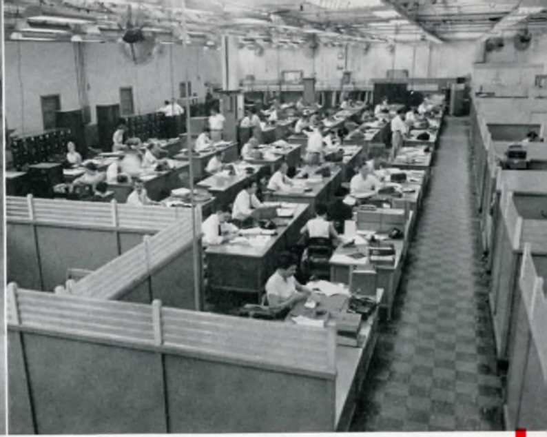
THE LARGE and efficient Accounting Department, or "green eye-shade department," as it is more familiarly known.