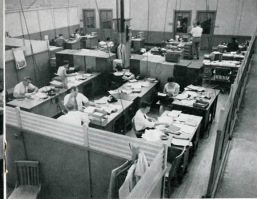
THE ORDER DEPARTMENT is shown in the immediate foreground, and in the rear is part of the Industrial Sales Department.