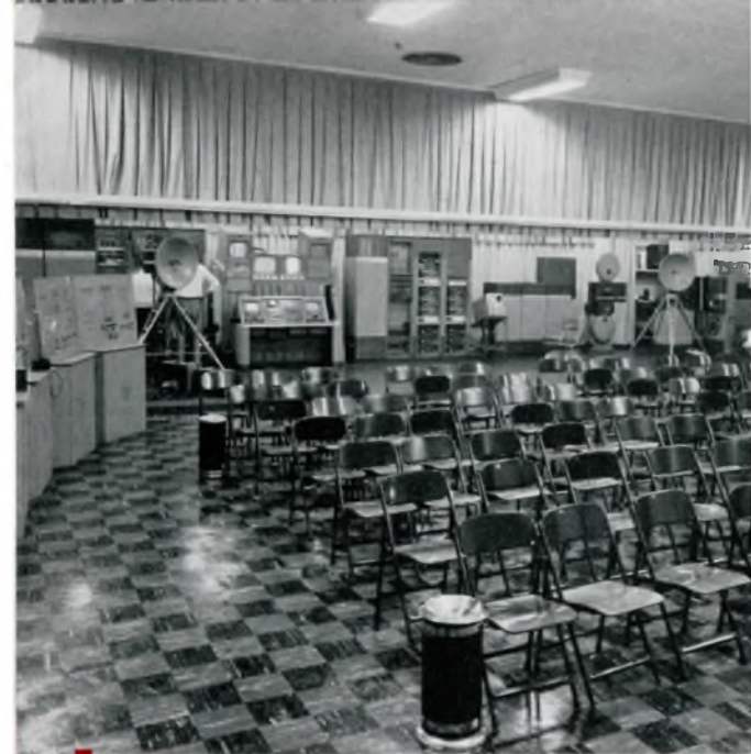
LOCATED IN THE center of Plant 50 is the symposium room where engineering, sales clinics and demonstrations are conducted.