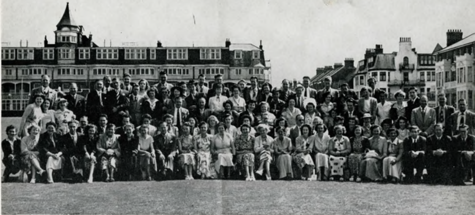
EMPLOYEES OF PHILCO (Great Britain) Ltd., at the works outing held at Margate, Kent, England. The outing was on July 4.