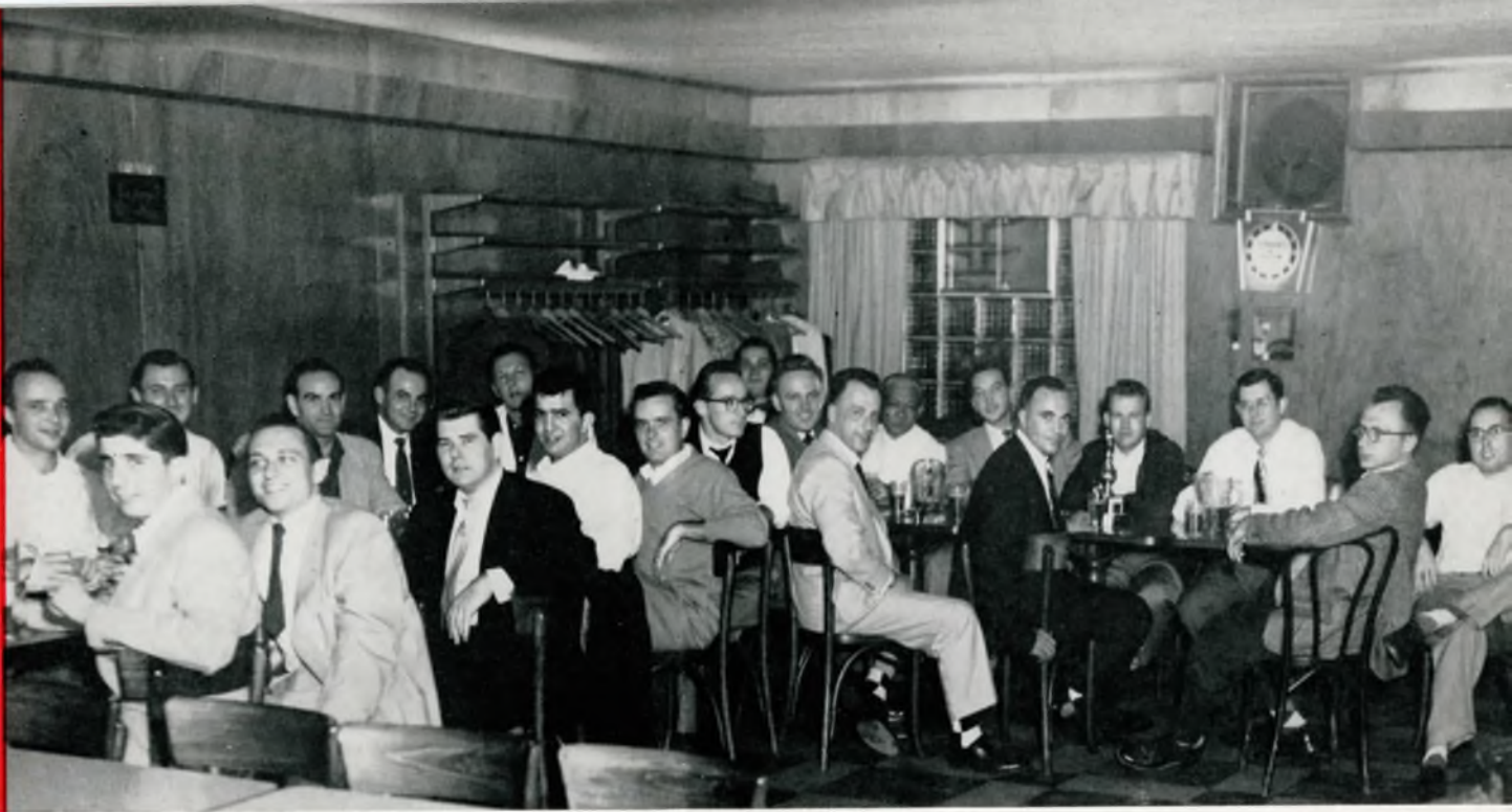
GENERAL VIEW of members of the G. and I. Softball League at a season-end gathering at John's Hoffbrau to present trophies to the winning teams.