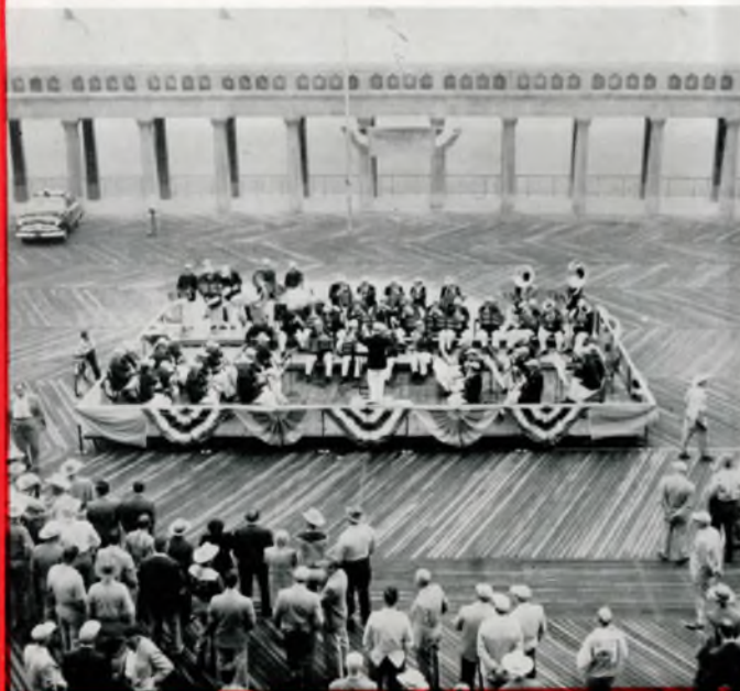
PHILCO DEALERS hear the band at Atlantic City. ▼

The Philco Band enjoys a national reputation in its field and its concerts are a welcome addition to the musical life of the Philadelphia area. Talented employees may join the band. For information, call Extension 388.