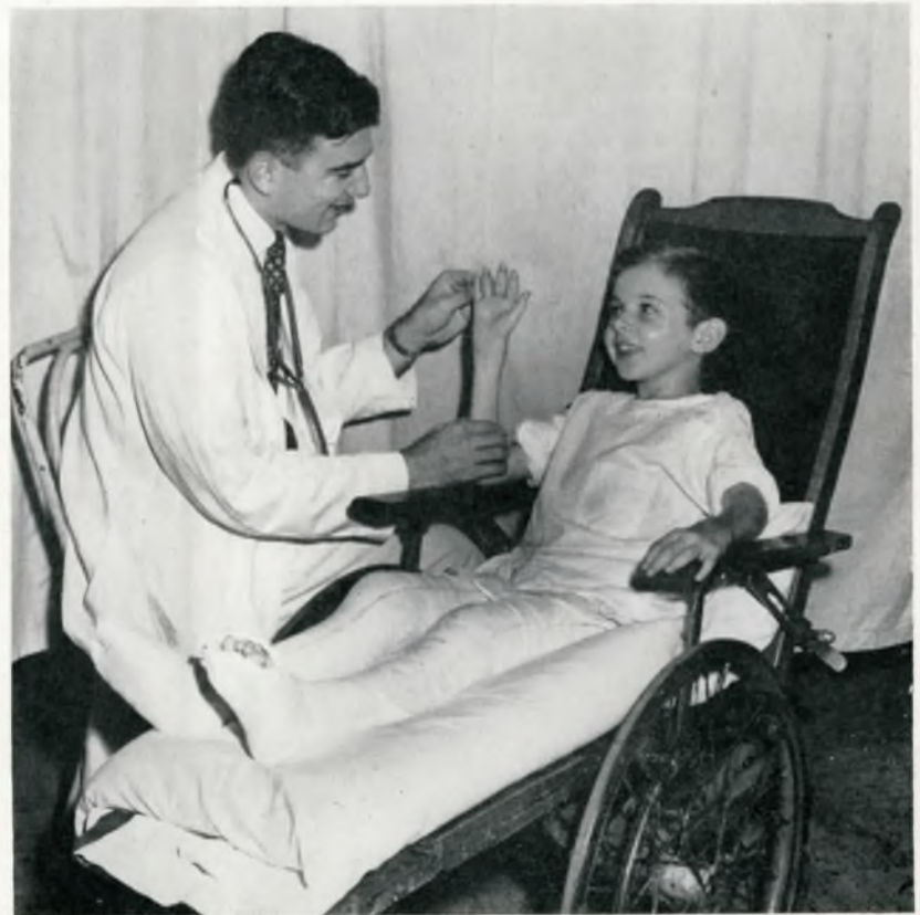
THIS YOUNGSTER is on the road to recovery, thanks to the Arthritis and Rheumatism Foundation, which provides aid to hospitals and clinics in the diagnosis, treatment and rehabilitation of arthritis victims. Your gift to the United Fund will help provide as well, research, public education, volunteer services in clinics and treatment for bed-ridden and housebound arthritics.