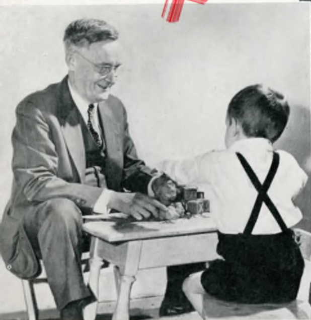
TESTING THE REFLEXES of this youngster, the psychotherapist plays a vital rôle in combating one of mankind's saddest afflictions—mental illness. Meeting the need for diagnosis and early treatment centers is the Mental Health Association, which you help support through your gift to the United Fund.