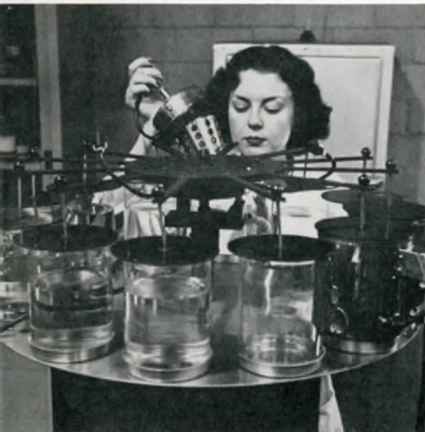
THE CURE FOR CANCER may be found in this laboratory—tomorrow or next week or perhaps next year. But until it is found, cancer research must go on. You can aid in this relentless fight against one of mankind's greatest killers through your fair-share gift to the United Fund.