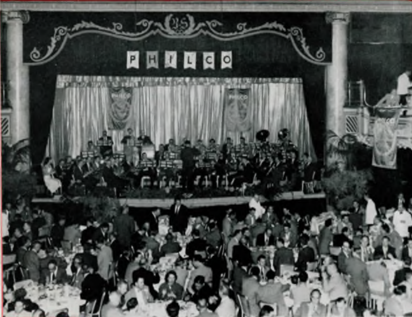
EMPLOYEE-STOCKHOLDERS hear the Philco Band at the Bellevue-Stratford.

The modern custom of children going about the neighborhood wearing masks and fancy costumes and asking for apples, cookies, etc., stems from the Seventeenth Century, when Irish peasants begged for luxuries for St. Columba, who had replaced in the Irish traditions Samhain, the old "lord of the dead."