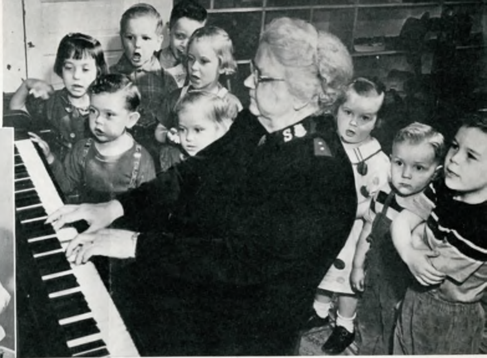
THEIR LITTLE VOICES raised in song, the cares and problems which caused them to be neglected by parents are forgotten. Looking after the unfortunate and underprivileged child is a rôle in the great drama played daily by the Salvation Army. Its 35 agencies are among the 250 separate agencies and services which your United Fund dollars help support.