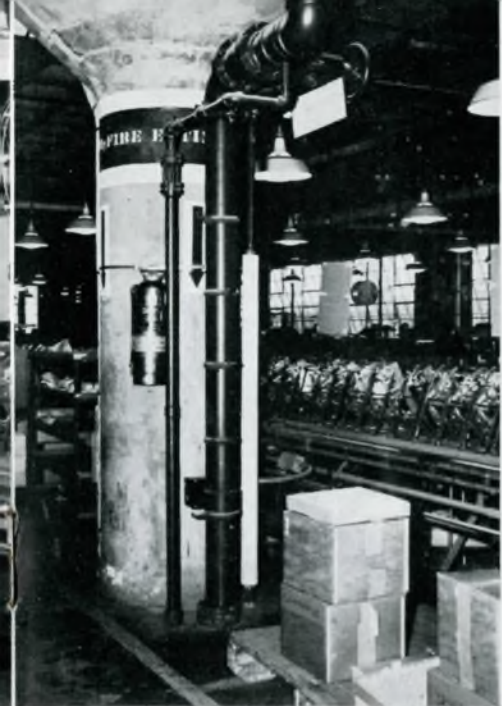
THE ABSENCE of obstructions at fire equipment and sprinkler stations provides an example of good housekeeping, which is the aim of all departments at Philco.