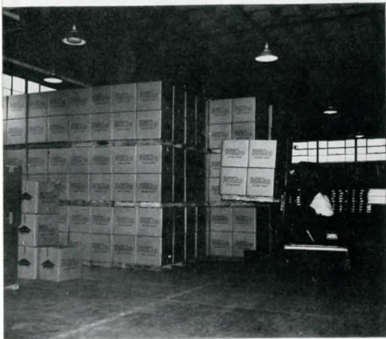
ABOVE—Safe piling of stock provides against accidents and fires. The Plant 3 stockroom is a model of good housekeeping.

Often we think of good housekeeping as meaning a clean floor. There is much more to maintaining a good home than merely removing the surface dirt. The orderliness of stock piles; the arrangement of materials; free and unobstructed aisles; the elimination of rubbish and debris; the clear access to fire equipment, safety equipment and electric controls;