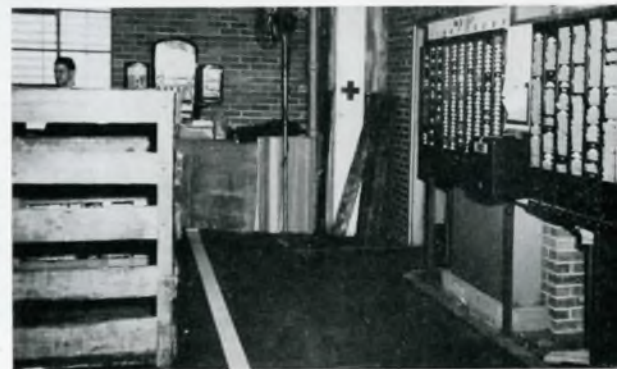
▲ HERE'S some BAD housekeeping—the aisle is clear, but the stretcher box is blocked.