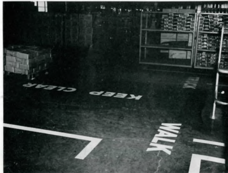
RIGHT—A main aisle intersection for trucking and passage is kept free of all obstacles.