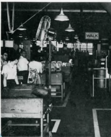
LEFT—Well-marked aisles aid in keeping the plants tidy.