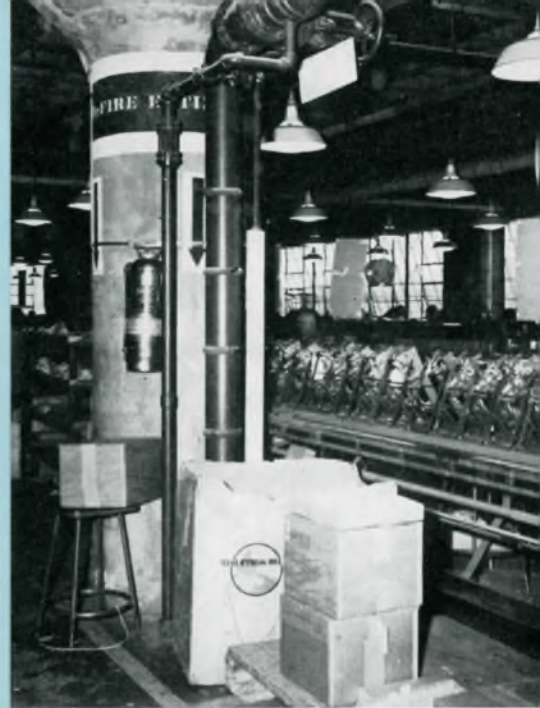
▲ AN EXAMPLE of how good housekeeping pays in the Television Section of Philco.