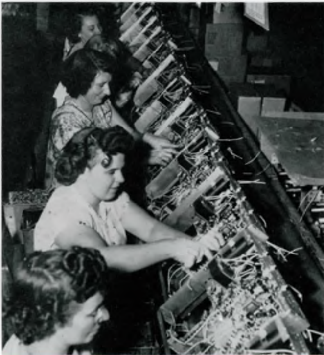
WIRING AND SOLDERING of television chassis are operations where the importance of quality workmanship is evident every minute. Experienced operators, who take pride in the fine work they do, help to make sure that every Philco television set has that world-famous Philco Quality.

The prospects for television and radio in 1950 are as bright as the lights on your Christmas tree. By doing a quality job in your everyday work you will do much to make real these future prospects.