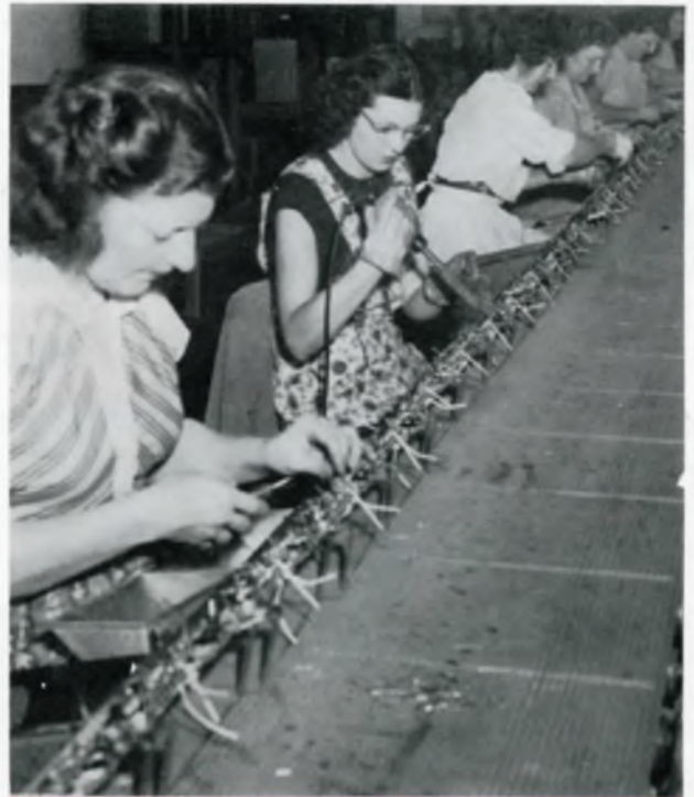
THE IF STRIP —one of the major sections of the television receiver—is made as a sub-assembly. Consistent with the Philco policy of assuring top quality in every detail, this IF strip is inspected and tested before it is added to the main chassis.