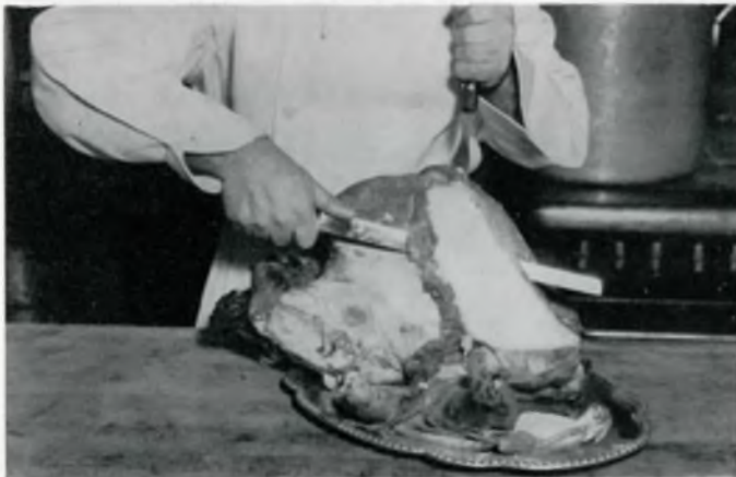
" . . . slice more white meat. . . . "