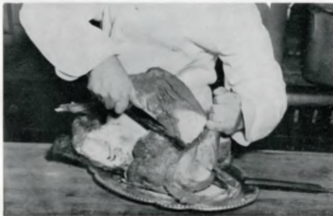
" . . . cut down the drumstick. . . . "