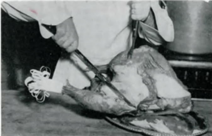
" . . . separate the leg from the body. . . . "