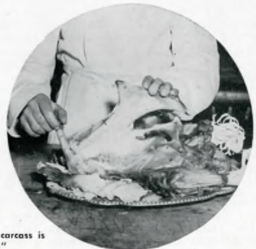
" . . . the carcass is bare. . . . "

It is customary when serving to ask for preferences as to light or dark meat. If no preference is expressed, then each serving should consist of several slices of each with a spoonful of dressing taken from the bird as served.