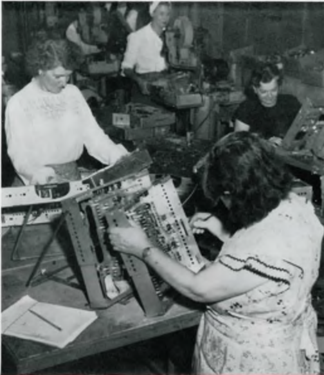
EVERY OPERATION is inspected to maintain Philco's high quality standards. Here the riveted sub-base gets a thorough examination before it is sent to the chassis wiring line.