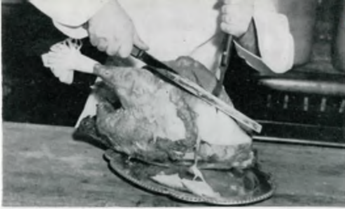
" . . . the first step—slicing the breast. . . . "