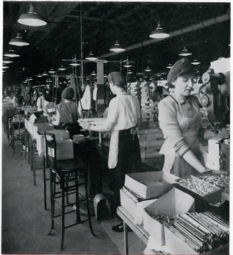
THE FIRST STEP in the assembly of the television chassis is the riveting of tube sockets, terminal panels and ground lugs to the sub-base.

We sat down and enjoyed a Broadway night club show in the man's living room along with the rest of the family. Some of the folks had never been in a town. As the show progressed I watched the faces of these children around me. Suddenly the full impact of the meaning of television came to me. Through this new medium, the world was being brought to