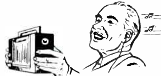
A boon to the hard-of-hearing

hearing aid giving the wearer perfect radio reception through a comfortable ear-piece.