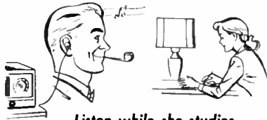
Listen while she studies