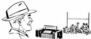
Listen while the game goes on