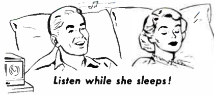
Listen while she sleeps!

The Private Listening unit is light in weight so that the wearer scarcely knows that it is on. Its design is the same as the finest