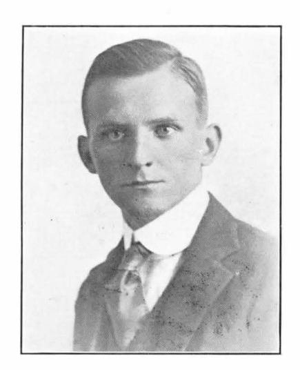
C. A. Russell THE SINKING OF THE GRACE

Then, escorted by our Commander, the Royal Party marched to the bows, where the usual exchange of courtesies was made, King Neptune's blessings and all good wishes to the ship's company and passengers were given as he and his Queen and retinue nimbly vaulted the ship's rail and disappeared beneath the waves, amid the shouts and laughter of all the passengers and crew.—(Hong Kong Post).