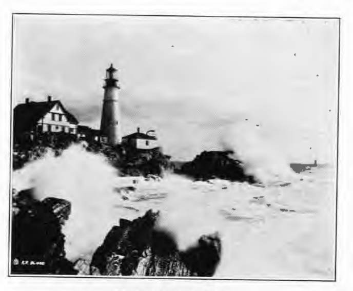
Portland Head Light

(Howell Cullinan is the author of two books, "Pardon My Accent," his experiences in a newspaper radio studio, and "Of All Places," a book of adventures all over the world. His news broadcasts over WEEI are enjoyed by all New England.)