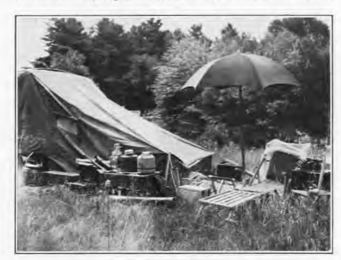
All the Comforts of Home

Just to give you an idea of the variety of the equipment: three specially made four-inch thick mattresses, eight woolen blankens, (kept in cedar chest with a wardrobe for anything from golf and fishing to dancing) a standard anto ice-box, a special large cork box for ice; three thermos bottles; a variety of electric devices, including a large cooker; two models, charcoal briquet broilers; (the auto heater provides heat—the rear auto light illuminates the tent); a variety of flashlights; a churn which will make a pound of butter in five minutes; a five-gallon water bottle and a gallon water bottle; a gallon glass jar; a folding cot (two