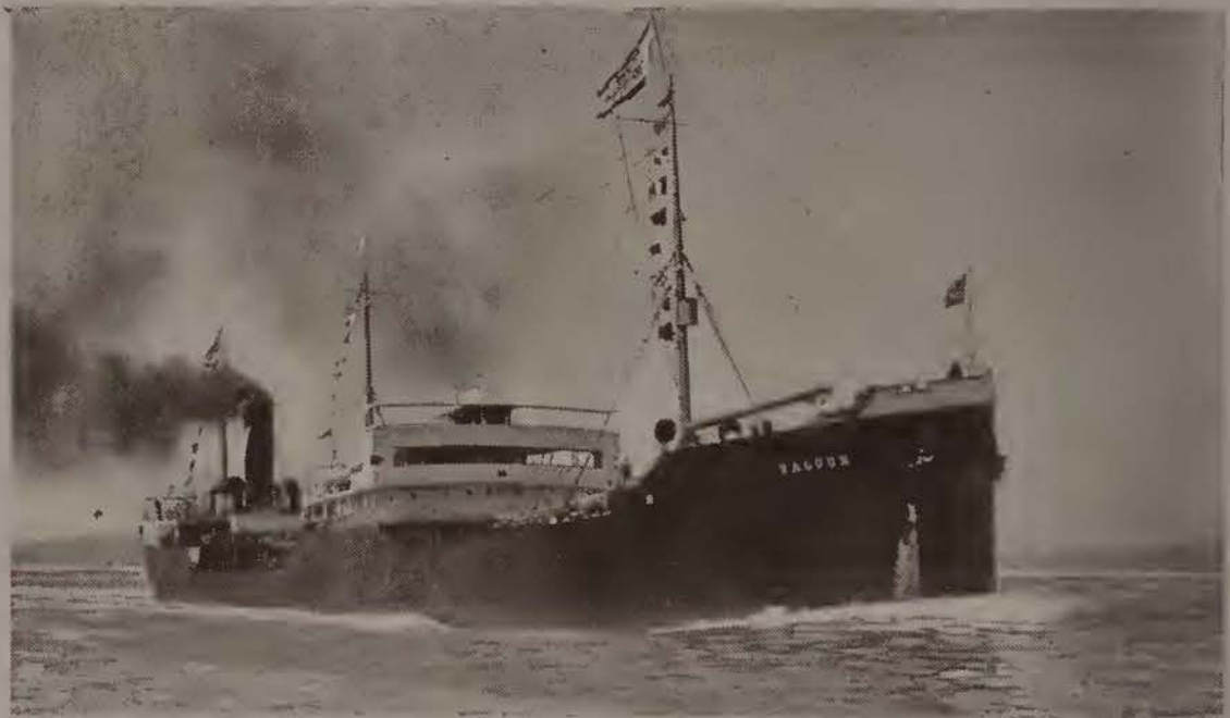
The RCA equipped S. S. Vacuum, of the Vacuum Oil Company