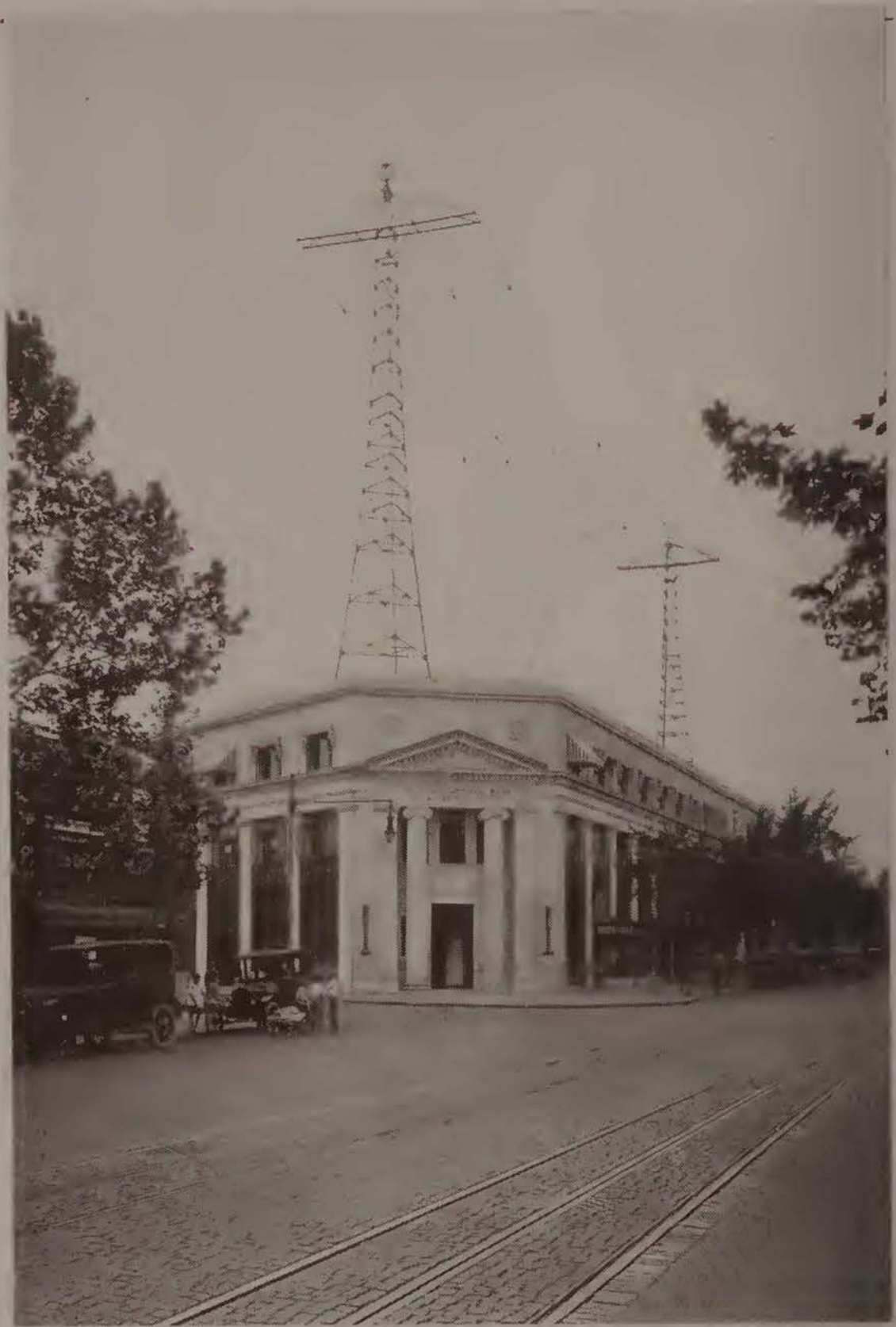
BROADCASTING ANTENNA OF RCA STATION "WRC" Atop the Riggs National Bank Building at Washington, D. C.