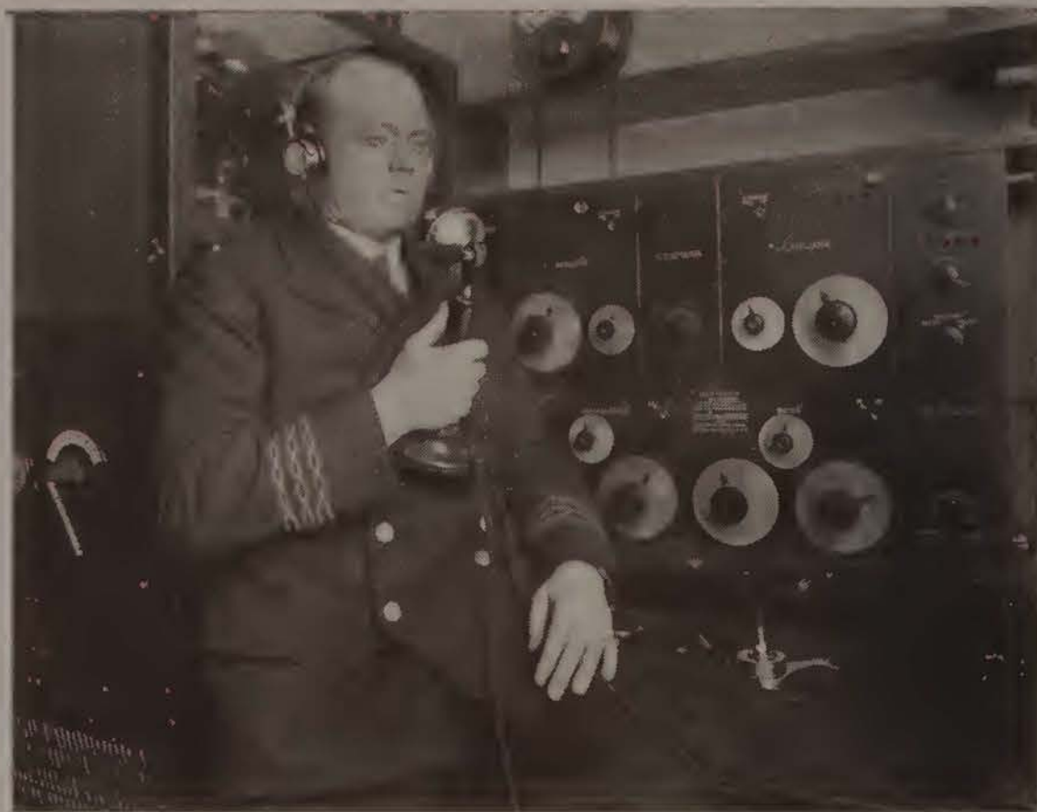
RADIO CORPORATION SHIPBOARD SET Installation on S.S. Leviathan

generate sufficient power in suitable form to transmit radio messages continuously across the Atlantic.