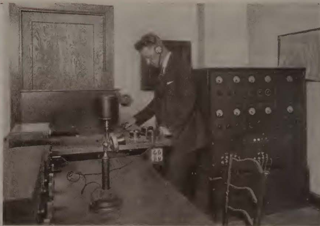
CONTROL ROOM OF DUAL STATION "WJZ-WJY" The Operator Stands before an Oscillograph—a Device for Checking the Characteristics of the Program being Transmitted.