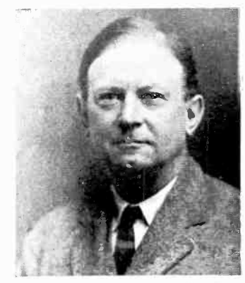
GEORGE WASHINGTON PIERCE