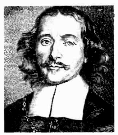
OTTO VON GUERICKE