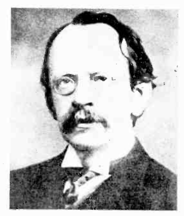
SIR JOSEPH THOMSON