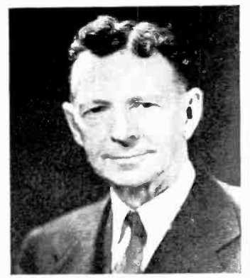
WILLIAM D. COOLIDGE