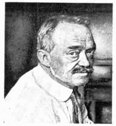
CHARLES FRANCIS JENKINS