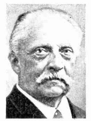
HERMAN VON HELMHOLTZ