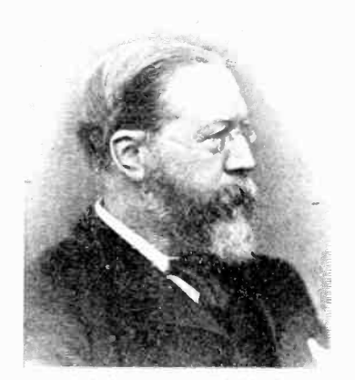
SIR WILLIAM PREECE