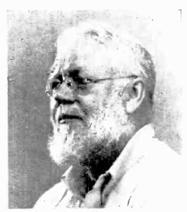
REGINALD AUBREY FESSENDEN