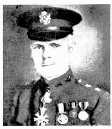
MAJ. GENERAL GEORGE OWEN SQUIER