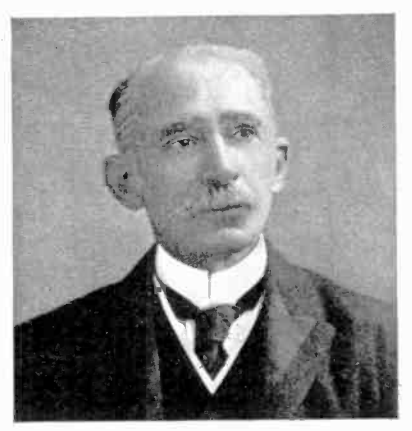
SIR AMBROSE FLEMING