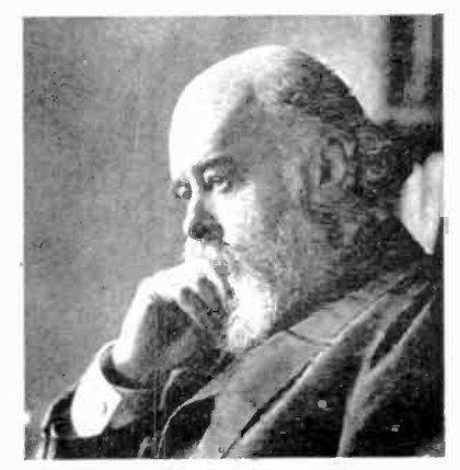
SIR OLIVER LODGE