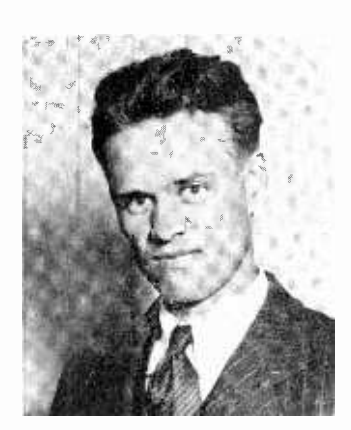
PHILO T. FARNSWORTH