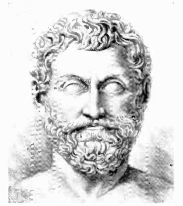
THALES OF MILETUS