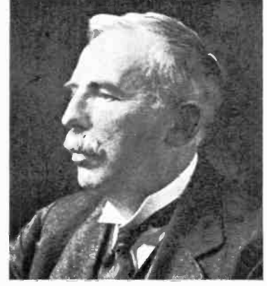
SIR ERNEST RUTHERFORD