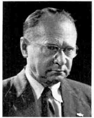
VLADIMIR K. ZWORYKIN