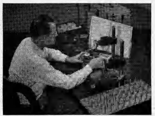
Checking tolerances on production machined parts. Precision testing at every step of manufacturing to be sure each part meets specifications and will perform at top efficiency in the finished product.

Welding aluminum by the inert arc method. Modern processes that save time and at the same time assure better construction. By these means savings are made and passed on in the form of high quality products.