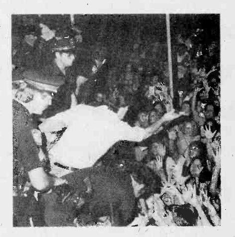
Donny Osmond dropped by one of the Y-100 Street Dances for a surprise visit to give out copies of his new album.

WAIN: It depends on the contest. If it's a contest that draws the audience in and has them participate, then it's