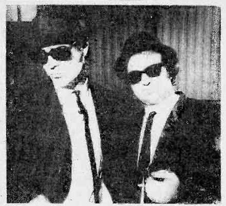
Blues Brothers "Briefcase Full of Blues"