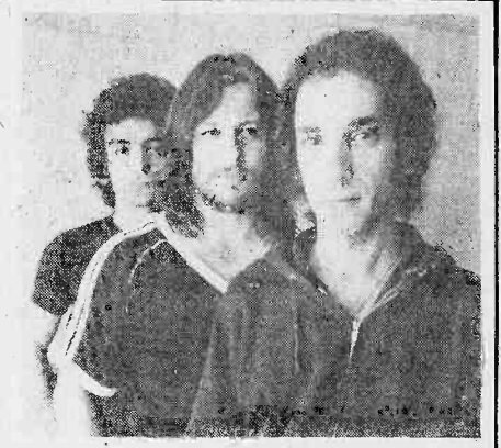
Crazy Horse Crazy Moon Album

"We feel he is the most exciting and unique new talent."