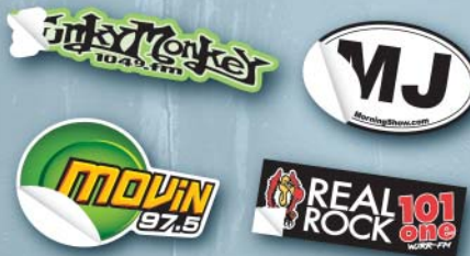
Samples of our printing

Push your station's brand by printing decals.