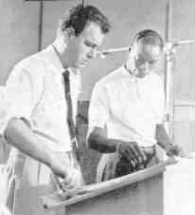
Nat "King" Cole's "Someone You Love" figured throughout recent "Mr. D. A." on TV. Here's Cole with conductor Nelson Riddle.