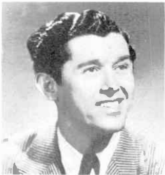
Three Roy Acuff songs that together have sold over 25 million are in his new Capital album, "Songs of the Smoky Mountains."