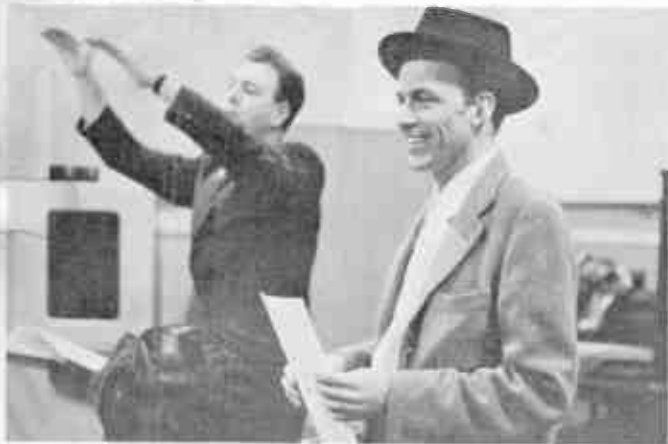
Last month Frank Sinatra appeared as singing star-narrator in TV's premiere musical presentation of Thornton Wilder's "Our Town." For Capitol he recorded four songs from the production for a 45 rpm album and two for a 78 rpm disk. Nelson Riddle accompanied. Artists above.