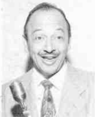
Mel Blanc is featured in two new Cap kids' albums, "Mrs. Hazard's House" and "Woody Woodpecker Meets Davy Crockett." Good fun.