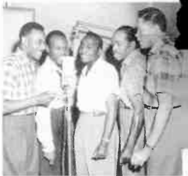
Making their debut on a Cap label last month were The Cues. "Burn That Candle" was on the topside and "Oh My Darlin'" on the back.