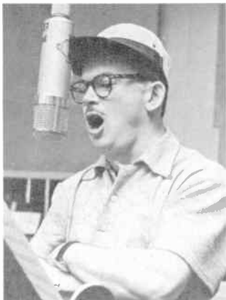
It had to happen. Mickey Katz comes through with his rendition of "Yellow Rose of Texas" with Cap disk, "Roiselle From Texas."