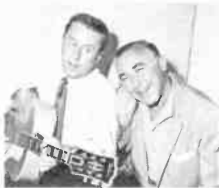
Ralph Marterie of the Mercury label lends an ear to the humorous George Gobel as he strums guitar. George has signed with Victor.

Fifty tuned cowbells, two claxon horns, six ship's bells, a large washboard, two cymbals, two small cannons, two pistols, a plumber's plunger, a trainman's lantern, and a privy seat comprise Spike Jones' new 24-karat, gold-plated cowbell musicale set.