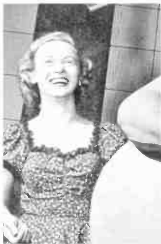
Jean Shepard appears obviously happy with her latest Capitol wax of "I Thought of You." On the backside is "Beautiful Lies."