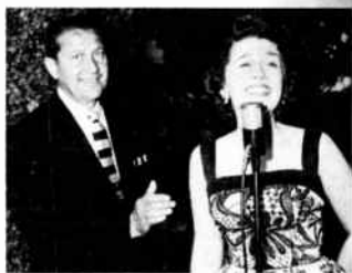
Champagne Lady Alice Lon bubbles out a song directed by Lawrence Welk. After 4 top TV years in L.A. Welk show goes network on ABC.