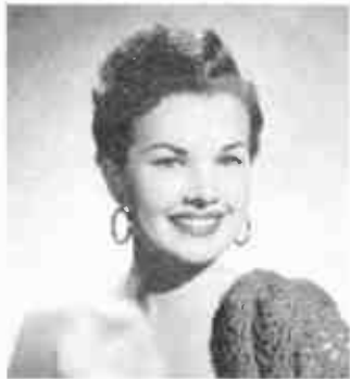
A new recording contract with the Dot label finds Gale Storm singing "I Hear You Knocking" backed by "Never Leave Me."