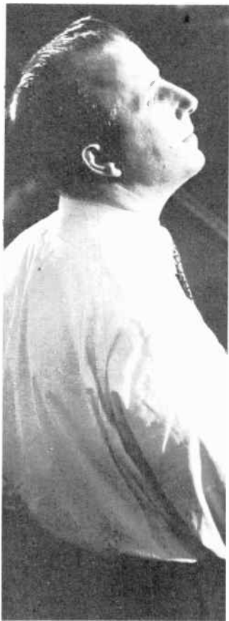
George Shearing's first packages for Capitol label, "The Shearing Spell," are out this month both as 33 \frac{1}{3} and 45 rpm albums.