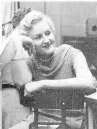
Cap star Margaret Whiting used "Those Whiting Girls" video show to launch her new Capitol disk "Lover, Lover (Never Leave Me)."