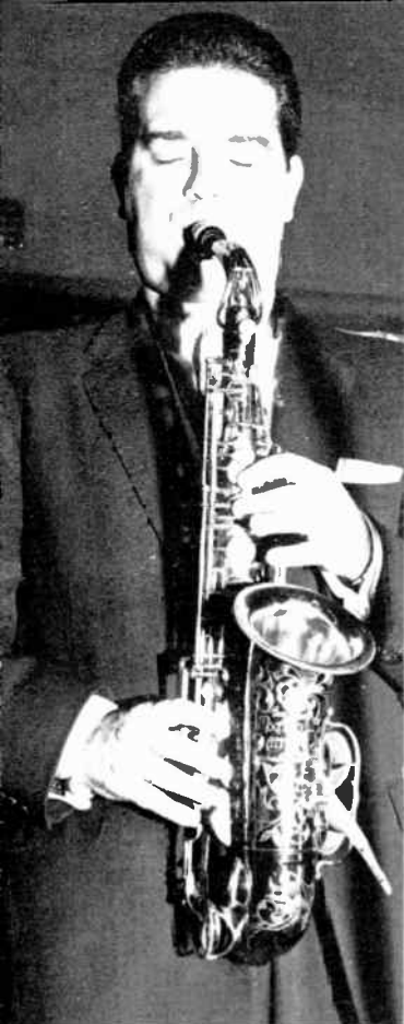
"Sounds and Songs" is name of new Capitol jazz album by Al Belletto (above) sextet. Stan Kenton discovered them in Chicago.