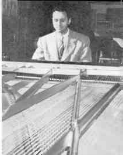
Pianist Leonard Pennario appears with the Hollywood Bowl Symphony in Capitol album, "Concertos Under the Stars." It's out now.