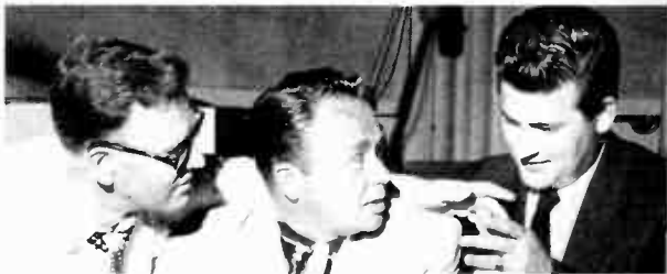
KEN NELSON Record producer

Born July 7 in Pasadena, California. Height: 5 feet, 8 inches. Weight: 180 pounds. Green eyes, Black hair.