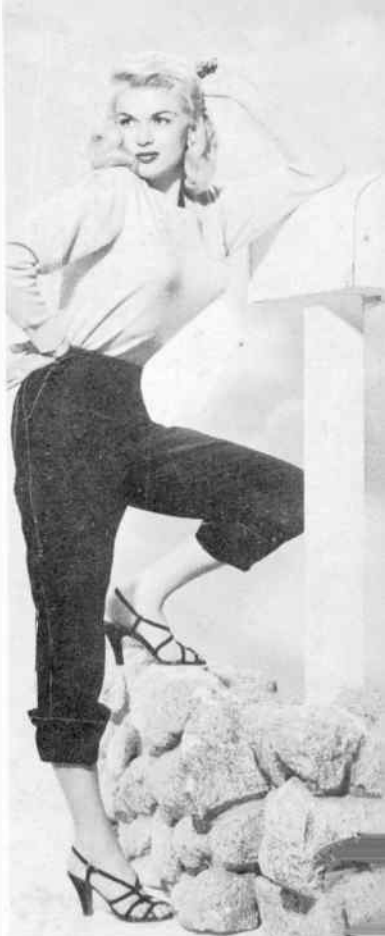
Nightclub singing under the name of Angel O'Hara is the latest portrayal by Jayne Mansfield in the Warner Brothers' film "Illegal."