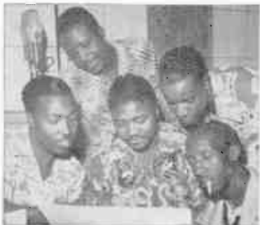
Showing the influence of their recent Hawaiian trek, Four Knights and their alternate member peruse the arrangement of latest: "I Was Meant For You", "They Tell Me."