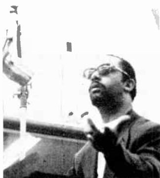
Perez Prado, who popularized the Mambo, conducts his band through a group of Shorty Rogers arrangements at a recent RCA Victor disk session. He's touring U. S. clubs.