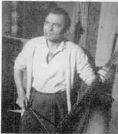
James Mason takes the bull (fiddle, that is) by the horns and saws out a theme as menacing as his countenance. He stars with Judy Garland in Warner's "A Star Is Born."