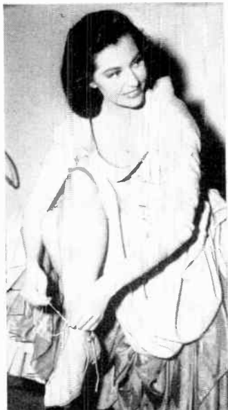
Cyd Charisse ties a ballet slipper on one of the "prettiest dancing legs in Hollywood," preparing for the next scene of her current flick, MGM's musical, "Brigadoon."