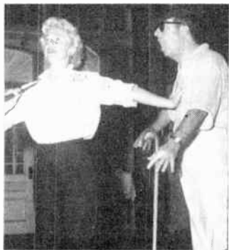
"I'd Rather Die Than Say Yes," says Doris Day in one of the Burlesque scenes which she and Phil Silvers perform in "Lucky Me." Sammy Fain & Paul Webster penned the music.