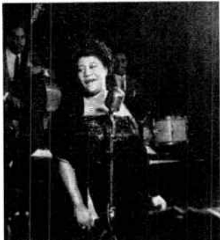
Ella Fitzgerald, whose "Melancholy Me" is out on Decca, made her third tour of Europe this spring as star of Norman Granz "Jazz at the Philharmonic." Pose is typical Ella.

Dead 10 years, Glenn Miller is still a top money maker. From 1939 to 1944, Miller earned $500,000 in royalties from RCA Victor. Since 1944, however, his estate has earned $400,000 in royalties — most of it within the last year.