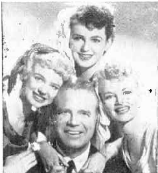
The trio of lovelies surrounding Horace Heidt are the "Heidt Steppers," part of his troupe. Heidt was honored recently at a banquet commemorating 30 years in showbiz.

A gigantic album covering Bing Crosby's entire career musically—a dozen 12-inch LPs retailing for about $25—is being prepared by Decca for August release. Crosby began doing some new recording for the autobiographical album in Decca's Hollywood studios last month.