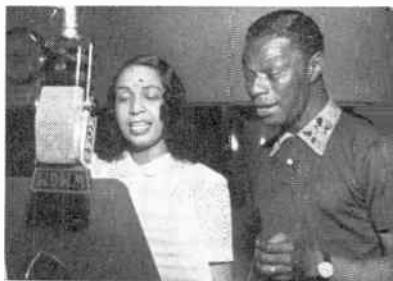
Mrs. Cole, former Duke Ellington singer, waxes with Nat (above). Nelson Riddle (left) is arranger on hits like 1954's "Answer Me."