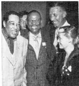
Duke Ellington (left) receives the congratulations of pianist "Fatha" Hines, Stan Kenton, June Christy and others at a cocktail party to celebrate his 25th show-biz year.