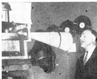
Billy Murray demonstrates how records were made in the early part of his career, clear back in 1903.

F OR many years the short, stocky comedian with the heartwarming smile and never-failing sense of humor was the star comic and master of ceremonies of a troupe known as the Eight Famous Victor Artists. His popularity declined after the in-