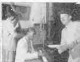
Nat guests on Bing Crosby's radio show in 1951, the year his big hit was "Too Young."