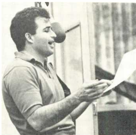
Initial appearances will be in Sandusky, Ohio, May 26; Detroit May 27, and at the Indianapolis Speedway races May 26 to 30.

Plans are being formulated for a nation-wide tour this summer to include both PA's and singing engagements.