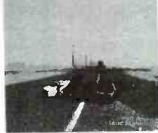
THE LEAVING TRAINS