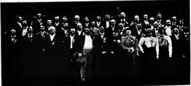
A few of the delegates and leaders who attended the Convention of the International Association of Distributors at Chicago, July 18-22.