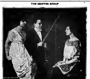
THE GRIFFES GROUP