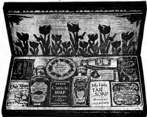
Lucky 11's Combination in Display Case—Store Value $3.35.

11 high class standard toilet articles which are in big demand everywhere. 11 big values, each full drug store size. Retail value $3.35. Costs you only 65c in quantities. You sell for $1.50 to $2.00 and make from 100% to 200% profit. Lucky 11 is the fastest seller ever put on the market. Goes like hot-cakes. When you show your customer this beautiful toilet set, the flash and riot of color will dazzle her eyes. Everybody wants it—everybody buys. Don't miss out on this Big Special Offer.