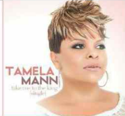
TAMELA MANN Taker of the hot box!

A WEEKLY ROUNDUP OF NOTABLE CHART ACHIEVEMENTS