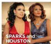
SPARKS and HOUSTON

Although bittersweet, the late Whitney Houston achieves her first posthumous top 10 on Adult R&B as "Celebrate," her duet with Jordin Sparks, lifts 13-10. With a 14th top 10 title, she ties Toni Braxton and Alicia Keys for the second-most top 10s among women in the chart's history. Only Mary J. Blige has more (16). This milestone is equally important for Sparks: She pegs her first top 10 on the tally. Her only previous hit, "No Air," her duet with Chris Brown, peaked at No. 31 in 2008. WWMG Montgomery, Ala., leads the audience wave with the most plays (290) through Aug. 19, according to Nielsen BDS.