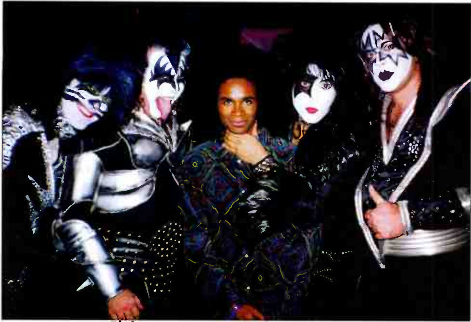
KIIS Los Angeles midday co-host (and ex-Milli Vanilli member) Fabrice Morvan thinks he can land a role in a Broadway play by talking to the characters in the hit musical "Cats." Shown, from left, are Grizabella, Tumblebrutus, Morvan, Rum Tum Tugger, and Bombalurina.