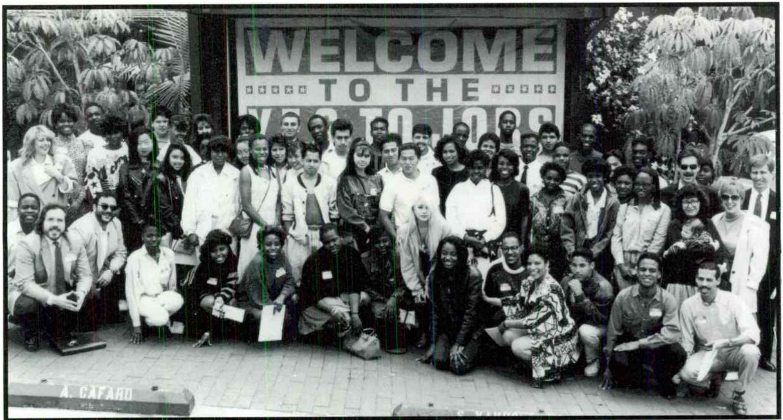
Y.E.S. TO JOBS Interns 1987