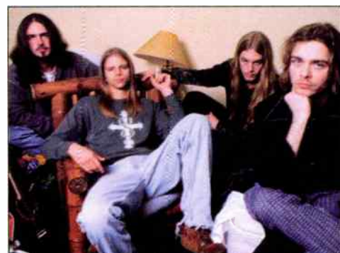
Days Of The New