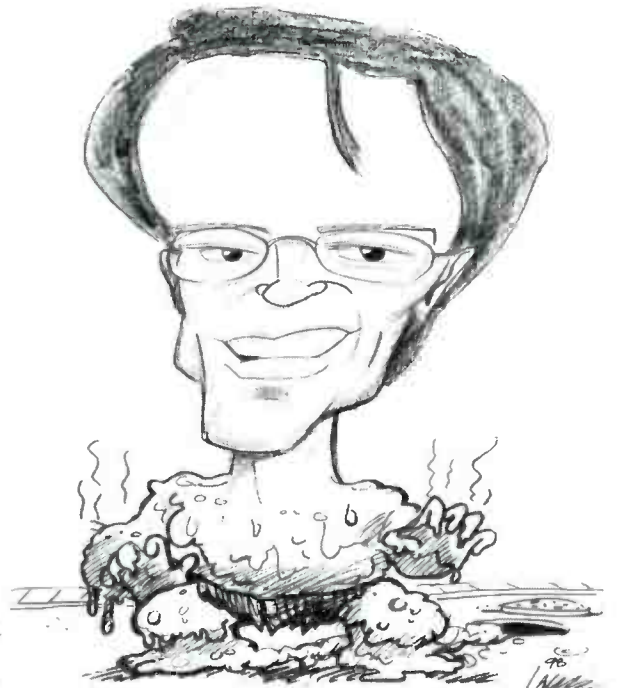
GREGG STEELE • WZTA