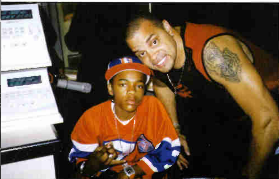
Rapper-turned-actor Bow Wow, left, visits adult R&B KHHT (Hot 92.3) Los Angeles to discuss his new movie, Like Mike , with actor-turned-morning-host Sinbad.