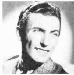
EDDIE DUCHIN "Magic Fingers of Radio"