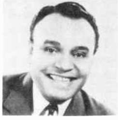
LUCKY MILLINDER "Tempo In Tan"