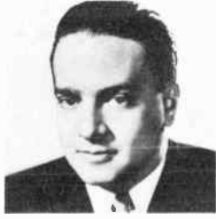
VINCENT LOPEZ "Fantasia On The Keyboard"