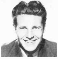
OZZIE NELSON "From Rutgers To Rhythm"