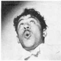
CAB CALLOWAY "Has Anybody Seen Minnie?"