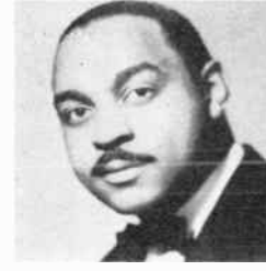
BENNY CARTER "One More Request For Body And Soul"