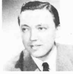
ALVINO REY "An Ace And Four Kings"