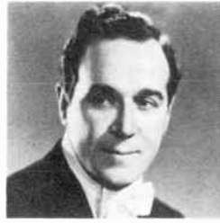
RUSS MORGAN "Romeo With A Trombone"