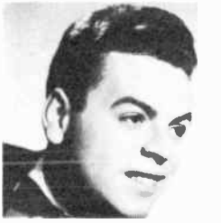
LES BROWN "It Pays To Jump"