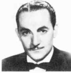
SHEP FIELDS "Love Me, Love My Music"