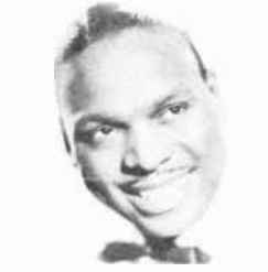
EARL HINES "Father, Make Us Know It!"