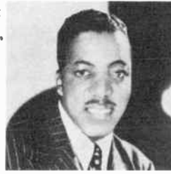
ERSKINE HAWKINS "Boy With A Horn"