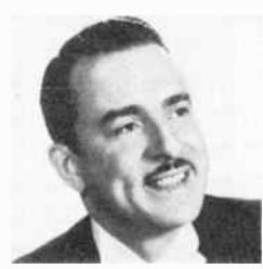
GLEN GRAY "Romance In Rhythm"