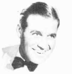
HORACE HEIDT "Horace, You Never Bore Us"