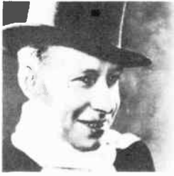
RAY NOBLE "Top Hat, White Tie, and Tails"