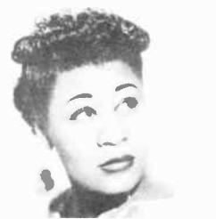
ELLA FITZGERALD "Ella, Every Fella Thinks You're Mella"