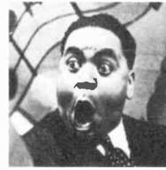
"FATS" WALLER "Yes, Yes, Well All Right!"