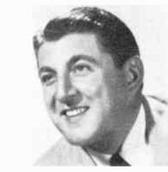
TONY PASTOR "Pastor, You're A Master With A Sax"