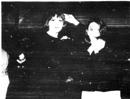
SEEN AT FIREBALL