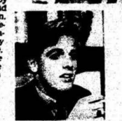
IAN TURPIE — COMPERE AND NEWS-READER