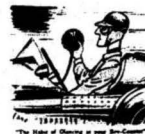
"The Race of Quality in your Preparation"

Drive with respect for the machinery. The real aces are those who can go fast enough to win and at the same time avoid over-stressing their engines, brakes, etc. Your rev-counter and oil-pressure gauge are your best friends — don't ignore them.