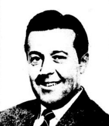
JOHN FORD NEWSBEAT and SPECIAL EVENTS