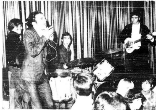
ADD WILD CHERRIES TO MAD-HATTER AND WHAT DO YOU GET?