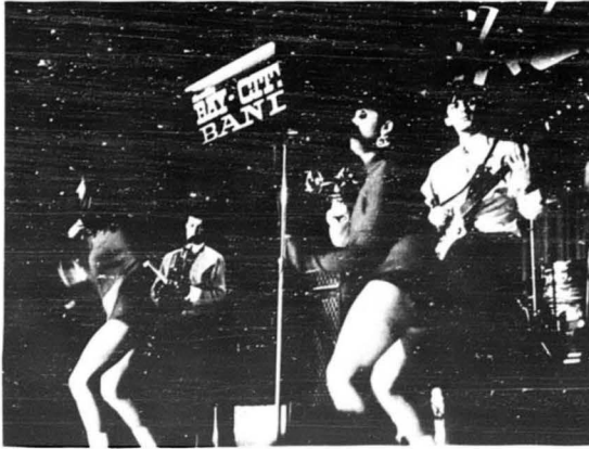
BAY CITY BAND AT FIREBALL