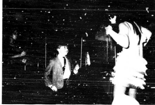
REELIN' AND A-ROCKIN'