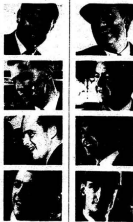
here's your line-up of ACTION RADIO personalities