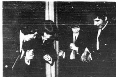
COLONIAL-STYLE WAR DANCE BACKSTAGE AT FIREBALL