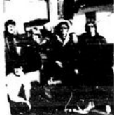
• Black Orchids

At this stage he plans to bring them into Melbourne in early October.