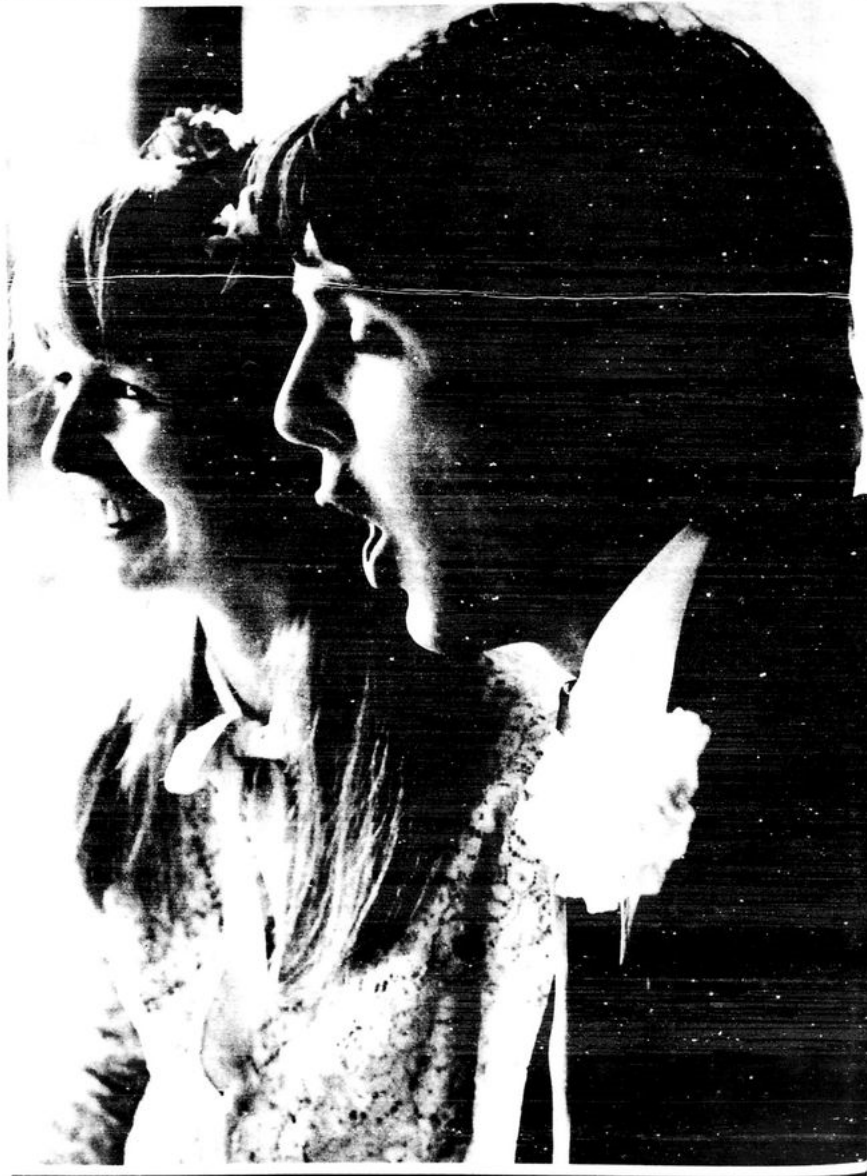
Jane Asher & Paul McCartney