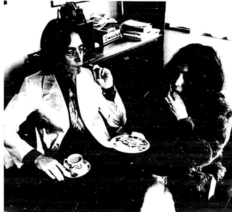
BELOW: JOHN LENNON AND YOKO ONO