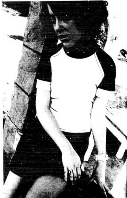
The ever-smart little black and white dress. White insert on bodice and white cuffed sleeves. Made in wool light enough for spring. Reduced to $10.00.

EVER SMART COLORS AND STYLES. BOTH OBTAINABLE AT LIVERPOOL'S NEW IN-SHOPPE (and other branches).