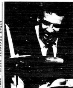
Buddy Rich enjoys himself on drums before his income tax trouble.