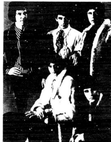
• Beaten Tracks

The Beaten Tracks have returned to Perth, because they make a good living and secure money there. Their trip to Melbourne was very successful, and when they come back they intend to put down some tracks for Festival records.