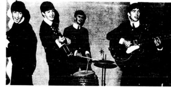
ABOVE: THE EARLY BEATLES