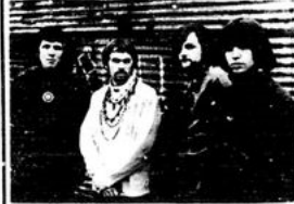
THE IRON BUTTERFLY

The disc could easily help the Iron Butterfly to tap up the international "cream" or open many "doors" for this type