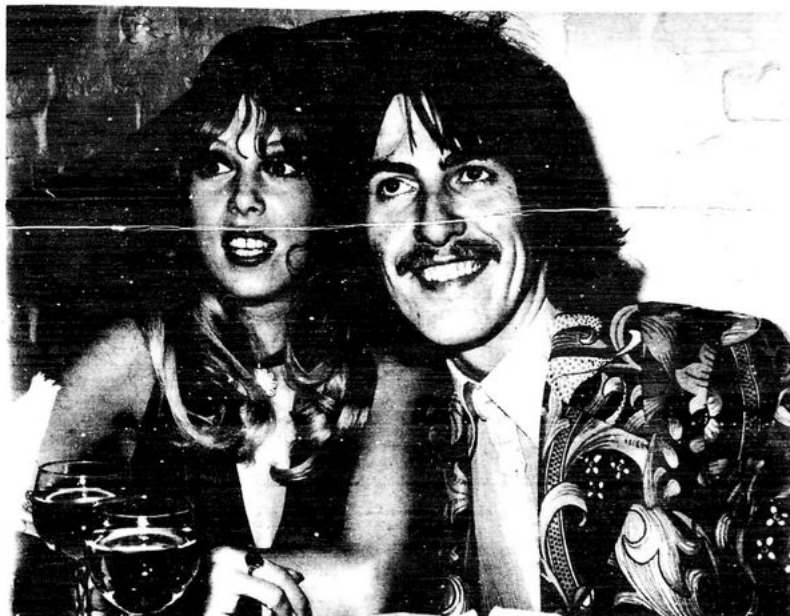
● George and Patti Harrison at the opening party. Notice Patti's '30's make-up, including red lipstick

Paul McCartney said, "In the past, there were creative people who had to go on their hands and knees for work. They were the people where if you're good you're recognised".