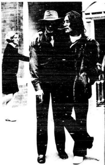
● John Lennon, outside Apple Tailoring, with one of the male models