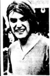
David Davies of the Kinks — his new record "Days" is a big hit all over the world.

He has never been in better shape, and one of his friends who has known him from his beginnings of his rise to fame... But it is reported that Dylan himself feels that America