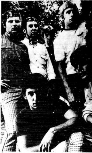
• The Vibrants

"At the moment what is wrong with the scene is that too many people are laughing at the business instead of treating it like a business, and too many people in the business are not treating it like a business".