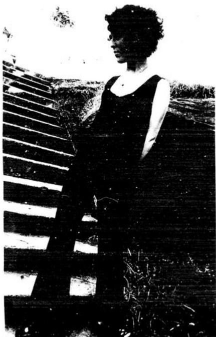
Black culotte jump-suit. Tiny buttons down the front and zip-up back. Can be worn as is or with cover-up under-blouse. Priced at $28.00.