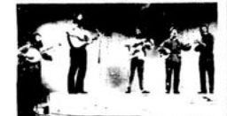
THE DUBLINERS ON TV

Melbourne was set in a fine mood for the Dubliners' concert this week at the Melbourne Town Hall when loyal sons of Ireland last Friday celebrated the 100th Anniversary of the birth of James Connolly, a hero of the 1917 Rebellion.