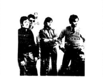
ONLY TOP SWINGERS GROOVE AT PRESTON TOWN HALL — WHERE ONLY THE TOP GROUPS GET INTO ACTION. THE OTHERS MAY HAVE THE GIMMICKS BUT WE HAVE ONLY THE TOP GROUPS — THE OTHERS MUST FOLD