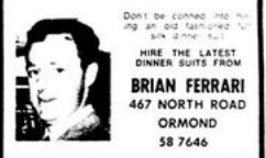
Don't be fooled into thinking an old fashioned suit will suit you.

The 1968 Battle of the Singing High amongst local Sounds is about to be launched throughout Australia and radio stations.