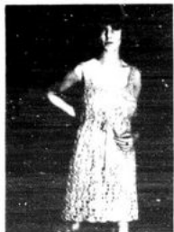
Orange and white cotton crocheted dress is a super feminine, with a soft fringe under the bust. Would be an eye stopper at a party, in big size 1-88 crocheted.