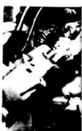
The suits are then completely checked to assure that they have extra and