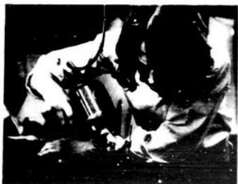
The suits were then cut with a lethal looking cutting machine by this long-haired swinger.