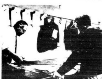
After the first fitting the suit is individually shaped with huge shears, by Navaro, according to the individual build of each client.