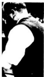
In a huge steam pressing unit, it is and that every piece hangs