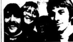
•THE UNION GAP

number with a good beat, very commercial. A good arrangement by Garry Puckett. If it's any indication of what he's capable of writing, they should have no trouble getting to be one of the top groups in the world. The harmony in this number helps bring it to a good climax.