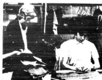
The linings and facings are tacked together.