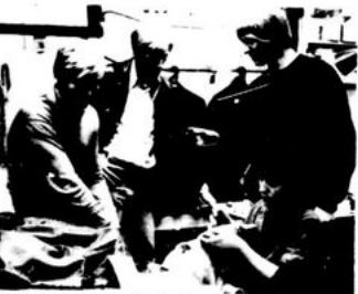
The finishing off process begins when the sleeve linings are hand sewn in, all the fitting stitches and tacking taken out, and the lining finished all through the garment.

They met all the mac pressers, and found it so we decided to tell you.