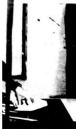
but there were hundreds of other designs from Carnaby. It was their job to choose from it their patterns were done.