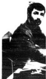
The boys had designed their other designs from Carnaby. It was their job to choose from it their patterns were done.