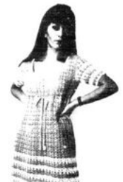
Orange and white cotton crocheted dress is a super feminine, with a soft fringe under the bust, and a soft ruffling low round neck.