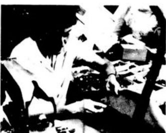
Sewing on buttons and making buttonholes, finishes the job.