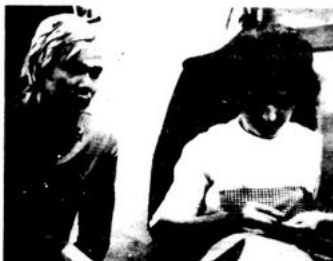
The facings then have to be turned and finished off, so the inside of the suit is as immaculate as the outside. Popsy hand sews the linings into place.