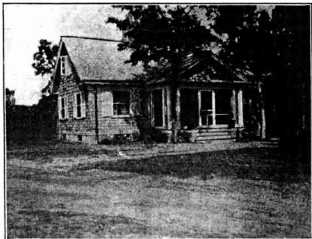
STAFF COTTAGE, MARION

Rochester, Mass., June 12.—The Rochester town team fearing defeat at the hands of the nine representing the Radio Corporation of America, at Marion, imported for the occasion a team made up of the fastest aggregation of baseball players ever possible to assemble on the diamond, and as a result came near losing. The wireless birds from the