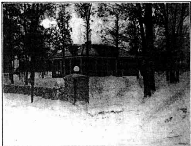
RESIDENCE OF ENGINEER-IN-CHARGE, MARION, WINTER