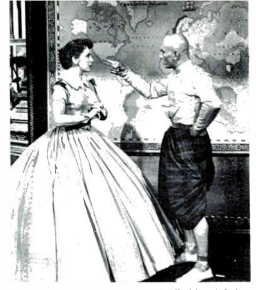
A scene from "The King and I." (At right), a scene in Rodgers & Hammerstein's "Carousel"