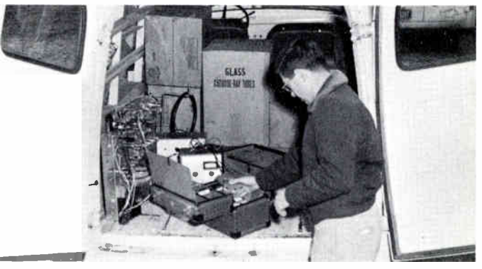
Earl inspects his parts' kit for completeness before leaving