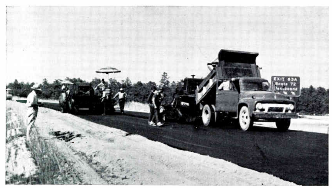
Trucks operating on parkway construction are under radio control at all times.

-Says Al Lizza, President, Lizza & Sons, Inc. Contractors for Garden State Parkway